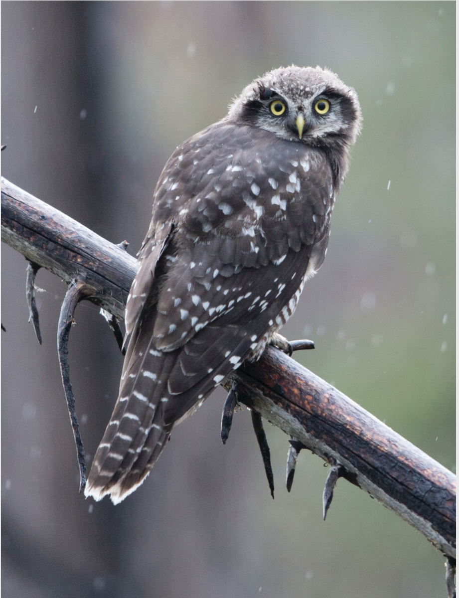
“Featured Photo” by © Paul Bannick of Seattle, Washington: Fledgling Northern Hawk Owl ( Surnia ulula ) in the Salmon River Mountains, Valley County, central Idaho, 28 July 2013. This was one of two families in 2013 representing a southward extension of the Northern Hawk Owl’s known breeding range by over 440 km.