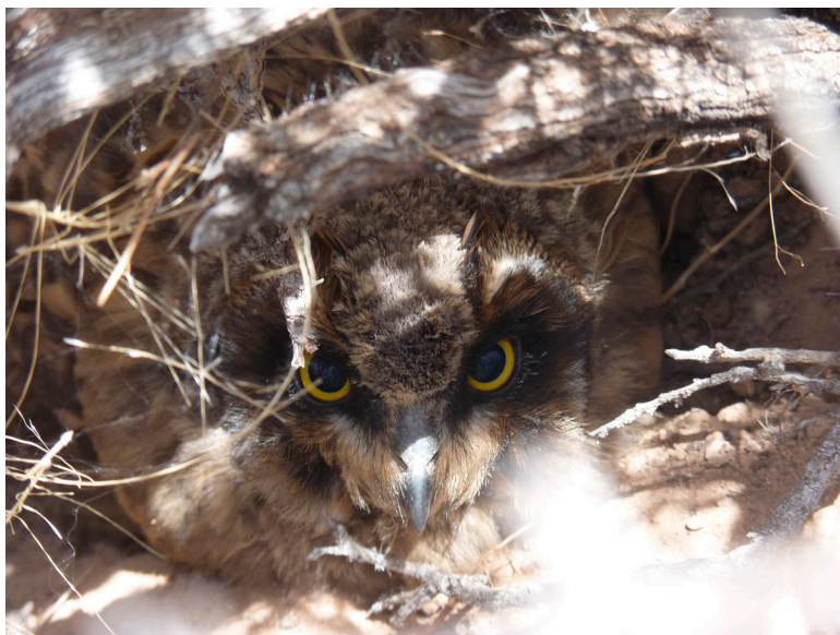
Figure 2. One of two pre-fledged Short-eared Owls roosting under a shrub ( Condalia ericoides ) about 120 m from the nest on Otero Mesa, Otero County, New Mexico, 3 June 2014.