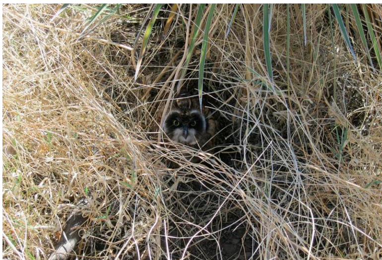
Figure 3. Pre-fledged Short-eared Owl in tobosa grassland west of Nutt, Luna County, New Mexico, 1 June 2014.