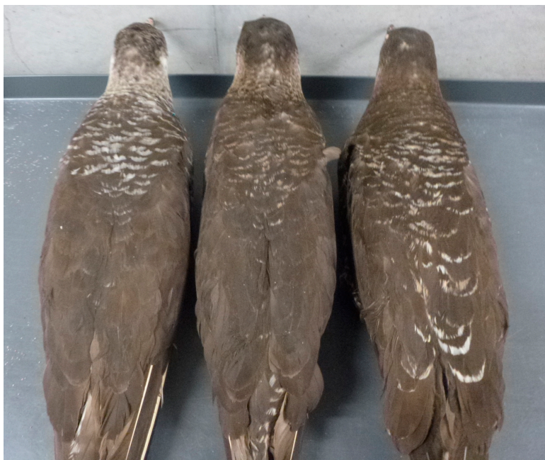
Figure 8. Specimens of winter adult Pomarine Jaegers collected in Monterey Bay, California, showing incomplete definitive fall body-feather molt. Left, CAS 11031, collected 8 November 1907; center, CAS 16399, collected 9 December 1909; right, CAS 16134, collected 13 December 1909. From left to right, the progression of molt of the primaries was to p5, p6, and p7, and the proportion of back feathers replaced in the fall body-feather molt was an estimated 40%, 50%, and 80%, respectively.