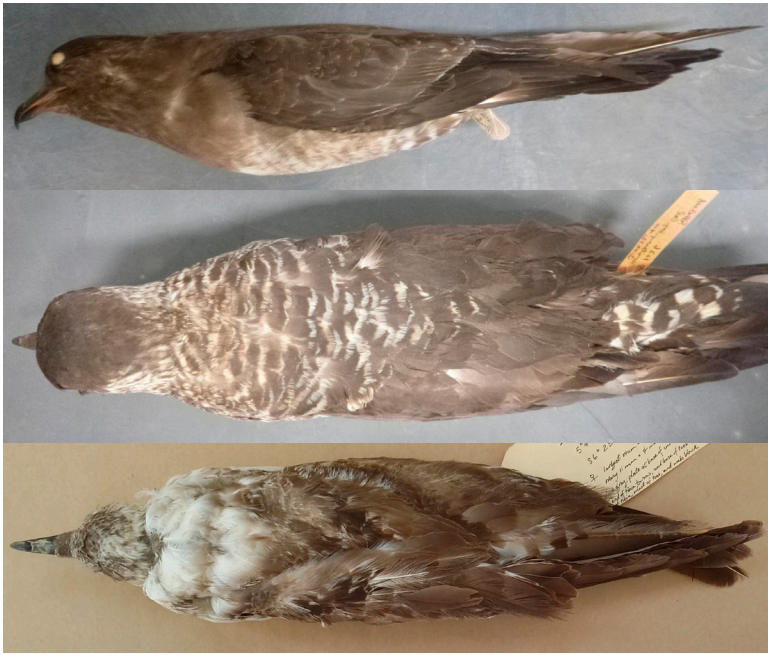
Figure 6. Specimens of jaegers collected during their second fall and winter. Top, Long-tailed Jaeger (CAS 16402) collected in Monterey Bay, California, 4 October 1909; center, Parasitic Jaeger (MVZ 17834) collected in Monterey Bay, 12 December 1910; bottom, Long-tailed Jaeger (SDNHM 41733) collected 69 km east of Cocos Island off Costa Rica, 26 January 1980. These birds are entirely (top) or primarily in worn formative plumage at ages of 16–19 months with limited replacement of back feathers in second fall in the center and bottom specimens.