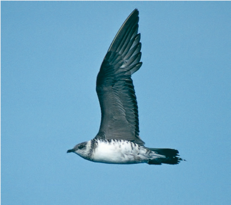
"Featured Photos" by Martin Reid of San Antonio, Texas: Long-tailed Jaegers ( Stercorarius longicaudus ) 5 km off Arica, Chile, 2 December 1993, showing variation in the plumage of nonbreeding adults and of a bird in its second winter (upper photo, top image). Note the barred central rectrix in the lower photo. In this issue of Western Birds , Peter Pyle and Martin Reid unravel the complex and hitherto inadequately understood cycles of molt in the jaegers.