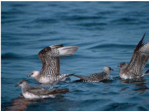
Figure 3. Long-tailed Jaegers, 5 km off Arica, Chile, 2 December 1993 (from left to right, birds DC3, 2C3, DC4, and 1C1 in Table 1). Note the bleached head feathers and underwing pattern of the second-cycle bird (2C3) and the incomplete back molt in the right-hand definitive-cycle bird (DC4).

Adult Long-tailed Jaegers ( Stercorarius longicaudus ) migrate to their arctic and subarctic breeding grounds in fresh “breeding” plumage and return to their Southern Hemisphere winter range in the same plumage. As a result, the species’ “nonbreeding” plumages are typically worn only at sea in the Southern Hemisphere and are under-represented in specimen collections. Descriptions and illustrations of the Long-tailed Jaeger’s adult nonbreeding plumage are variable and conflicting; most indicate it to resemble the adult breeding plumage, including a blackish cap and pale yellowish to whitish hind collar, but to be muted in color and/or to show indistinct barring to the sides, flanks, and undertail coverts (e.g., Cramp 1983, Higgins and Davies 1996, Malling Olsen and Larsson 1997, Dunn and Alderfer 2011, Sibley