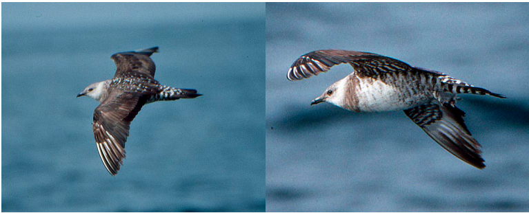
Figure 2. Second-cycle Long-tailed Jaeger, 5 km off Arica, Chile, 2 December 1993 (bird 2C4 in Table 1). Note the bleached head feathers, incomplete back molt, worn pointed central rectrix, and suspension limit between p7 and p8 of the formative plumage.