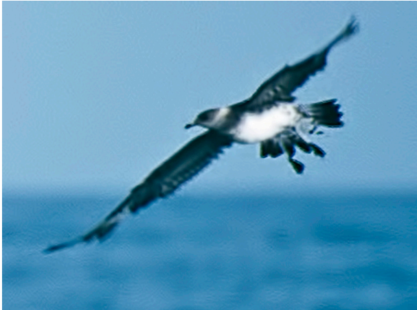
Figure 4. Presumed third-cycle Long-tailed Jaeger, 5 km off Arica, Chile, 2 December 1993 (bird 3C1 in Table 1). Note that the head plumage is darker and barring on the underwing is less extensive than in the second-cycle birds in Figures 1–3. Note also the relatively advanced primary molt (to p6) and the two pairs of barred central rectrices.

Among the 23 photos are 50 depictions of the 11 Long-tailed Jaegers. Careful comparison of plumage, molt progression, and positioning of the birds with respect to the sequence of photographs allowed us to identify each individual with confidence. We designated each individual, by cycle, as 1C1 (first-cycle bird); 2C1, 2C2, 2C3, and 2C4 (second-cycle birds); 3C1 (prob-