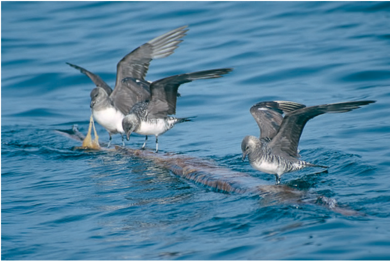
Long-tailed Jaegers ( Stercorarius longicaudus ) 5 km off Arica, Chile, 2 December 1993. Upper photo, two adults in nonbreeding plumage (left and right) and a second-cycle bird (center); note the head patterns and underwing patterns characteristic of these ages. These are birds DC3, 2C2, and DC5 in Table 1, p. 244. Lower, three adults; note the range of variation. These are birds DC3, DC5, and DC4 in Table 1, p. 244.