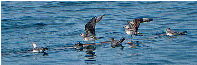
Figure 1. Long-tailed Jaegers, 5 km off Arica, Chile, 2 December 1993, showing variation in nonbreeding plumages of one first-cycle, three second-cycle, one probable third-cycle, and one definitive-cycle birds (from left to right, birds 2C3, 3C1, 2C1, 1C1, 2C2, and DC3 in Table 1). Note the bleached whitish heads of the second-cycle birds.