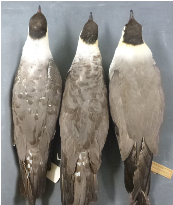
Figure 7. Specimens of second-summer (two years old; left two birds) and adult Long-tailed Jaegers (right) collected in Alaska during the breeding season. Left, MVZ 136444, collected at Barrow, 17 June 1957; center, MVZ 136452, collected near Barrow, 18 July 1957; right, MVZ 31474, collected at the Kowak River delta, 17 June 1899. The second spring body-feather molt is often incomplete, with retained feathers being either barred white or plain brown; the former appear to represent feathers replaced earlier, the latter feathers replaced later during the first fall molt. Over 96% of adult jaegers examined had undergone a complete spring molt, as in the right-hand bird.