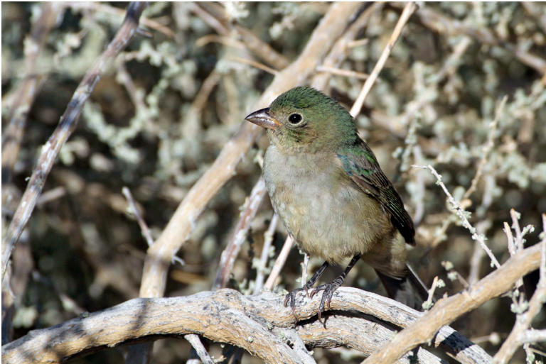
Figure 10. All of Nevada's four accepted records of the Painted Bunting during the 2015 review period were of immature/female-plumaged birds such as this one at the Corn Creek Field Station, Desert National Wildlife Refuge in Clark County, 8 September 2014.