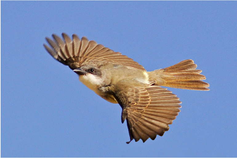
Figure 5. This second Thick-billed Kingbird for Nevada was found at the Overton Wildlife Management Area on 7 November 2014, where it remained for over a week. Nevada's first representative of the species was observed in October 1996.