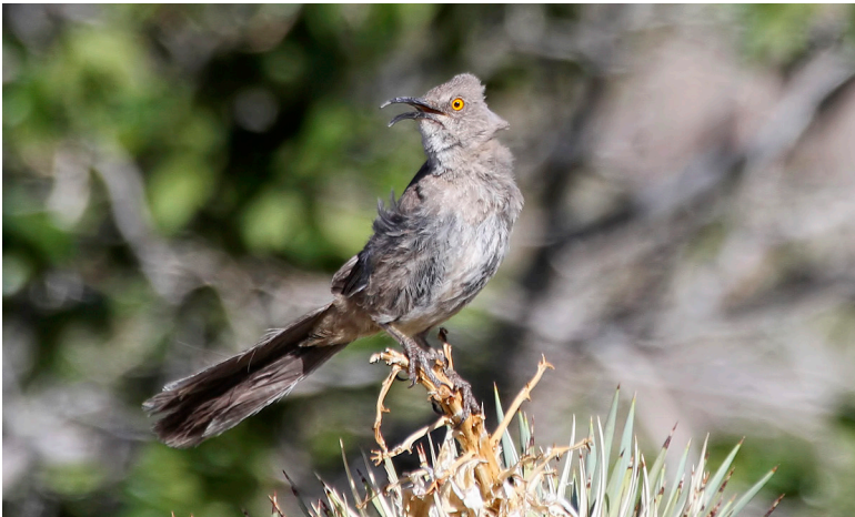
Figure 8. After the Curve-billed Thrasher was first noted at Searchlight, Nevada, on 7 June 2014, three birds were observed in September 2014. Since that time, reports of one or two individuals continue to come in to the NBRC and are posted at www.eBird.org regularly, though nesting has yet to be documented.