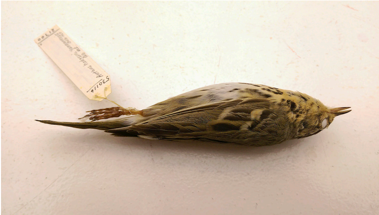
Figure 9. This Olive-backed Pipit, the second for North America, was collected on 16 May 1967 near Reno by Thomas D. Burleigh (1968). The specimen is preserved in the U.S. National Museum of Natural History, Smithsonian Institution, Washington, DC.