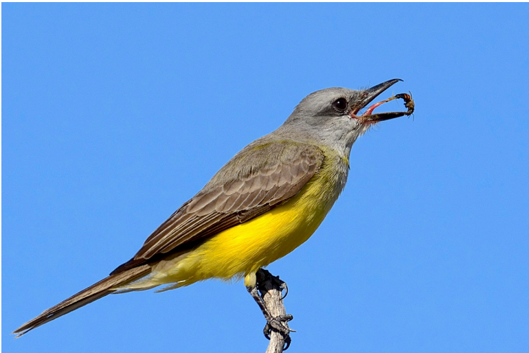
Figure 4. Another first for Nevada, this Couch's Kingbird delighted local and visiting birders for nearly two months (12 January–4 March 2015). The identification was confirmed by vocalizations and wing formula.