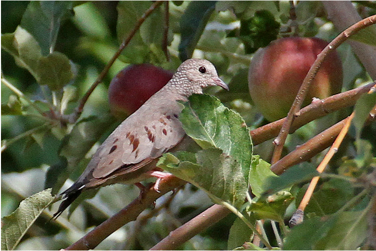
Figure 3. There are now five NBRC-endorsed records for the Common Ground-Dove in Nevada; the species was of “irregular occurrence” from the early 1960s to mid-1970s (Alcorn 1988:183), but since then only four records are confirmed, including the one of this female in Esmeralda County, 7–8 September 2014.