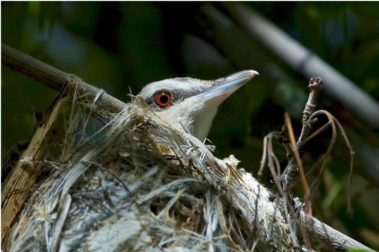
Figure 6. This female Red-eyed Vireo was paired with a Warbling Vireo in July 2013 at Rancho San Rafael Park in Reno.