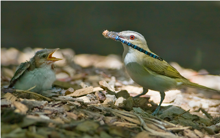
Figure 7. The two young fledged by the mixed pair of vireos in Reno did not survive their first month; one specimen was analyzed to confirm hybridization. This nesting was followed by an incursion of additional post-breeding Red-eyed Vireos, detected as singing males.