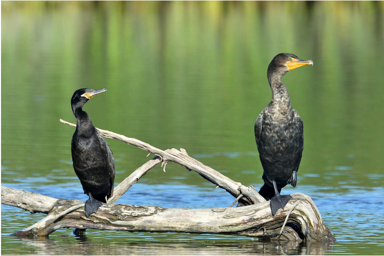
Figure 1. The Neotropic Cormorant has increasingly been joining its cousin, the Double-crested Cormorant ( Phalacrocorax auritus ), on southern Nevada waters in recent years. This adult was observed at the Clark County Wetlands Park over four months, October 2014–February 2015.