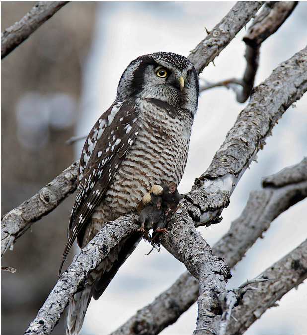
Figure 11. Northern Hawk Owl (NHOW-2008-3) at Hart's Pass, Okanogan Co., 5 October 2008.