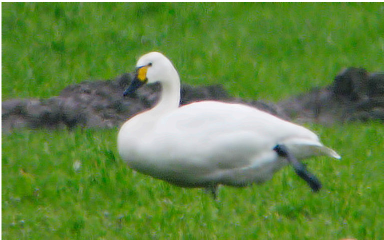
Figure 2. Bewick's Tundra Swan (BESW-2008-1) near Conway, Skagit Co., 1 March 2008.

Short-tailed Albatross ( Phoebastria albatrus ) (9, 2). A juvenile was 193 km west of Westport, Grays Harbor Co., on 6 Apr 2008 (STAL-2008-1; photo: GSM). Another juvenile was tracked via satellite transmitter through Washington waters 25–29 Sep 2009 (2009-1; RoS) as it moved south along the continental shelf break before continuing into Oregon and eventually reaching California. The bird hatched