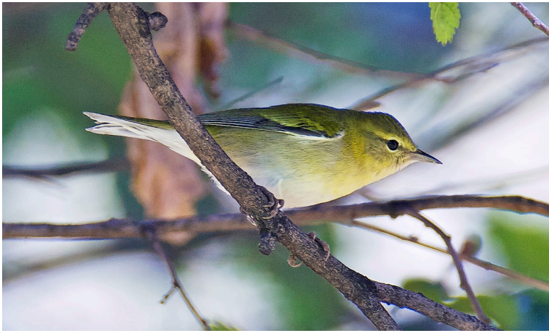
Figure 14. Tennessee Warbler (TEWA-2008-1) at Washtucna, Adams Co., on 8 September 2008.