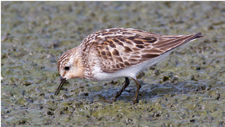
Figure 8. Adult Red-necked Stint (RNST-2009-1) at Ocean Shores, Grays Harbor Co., 24 July 2009.

experience of several committee members with these species convinced the WBRC that the extensive written description by an experienced observer was adequate for acceptance of the species to the state list. Key field marks noted include the white underwing patch bisected by a thin dark line (producing a “double flash” of white in flight), the languid flight style, overall size, dark upperparts, and relatively long tail. The photo supported the description, but only some members of the committee thought