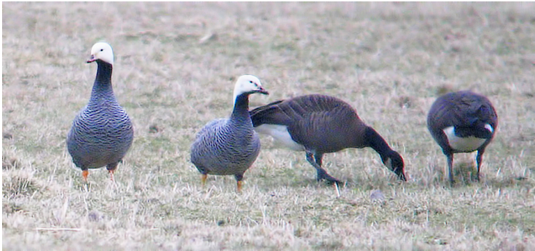
Figure 1. Two Emperor Geese (EMGO-2008-1) near South Bend, Pacific Co., 26 March 2008.