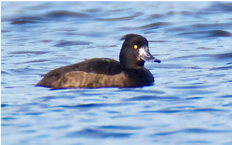
Figure 4. Female Tufted Duck (TUDU-2009-1) at Lake Erie, Skagit Co., 16 January 2009.

Providence Petrel ( Pterodroma solandri ) (1, 1). In 1992, 1993, and 1996, the WBRC voted with inconclusive results on a report of a Providence (also known as Solander's) Petrel about 50 km west of Westport, Grays Harbor Co., on 11 Sep 1983 (PRPE-1983-1; TWa, photo: MLu). The state checklist prepared by the