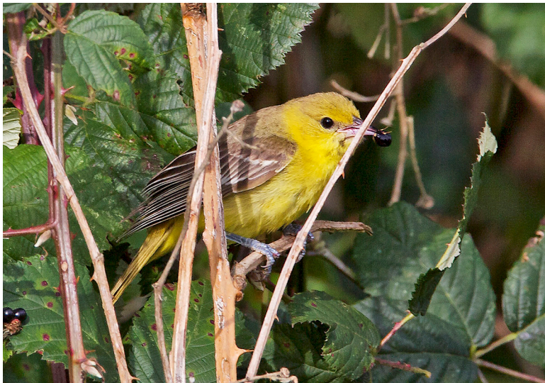
Figure 16. Hatch-year Orchard Oriole (OROR-2009-1) at the Hoquiam sewage-treatment plant, Grays Harbor Co., 24 October 2009.