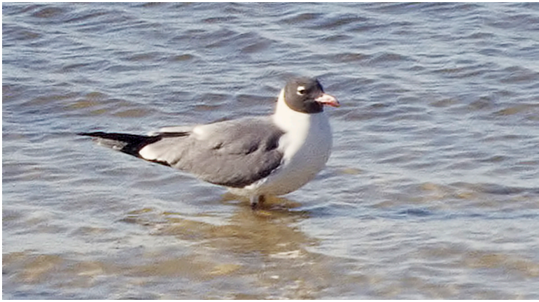
Figure 9. Adult Laughing Gull (LAGU-1998-1) at Ruby Beach, Jefferson Co., 10 May 1998.