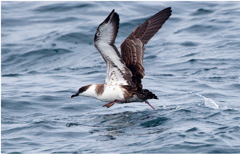
Figure 7. Great Shearwater (GRSH-2009-1) off Westport, Grays Harbor Co., 29 August 2009.