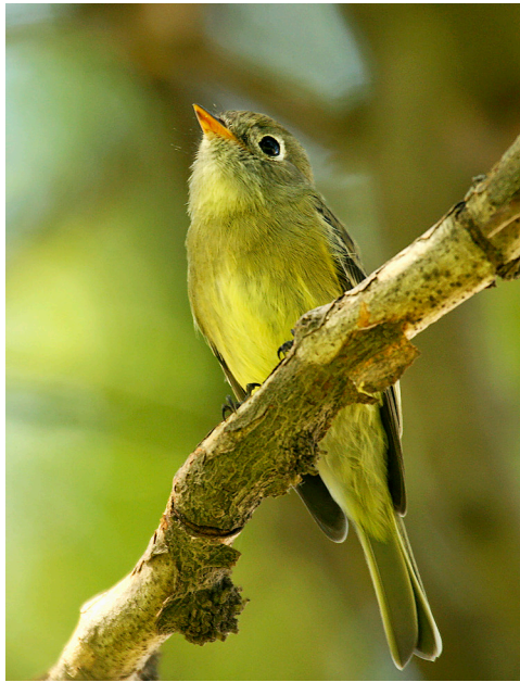
Figure 12. Washington's first Yellow-bellied Flycatcher (YBFL-2009-1) at Windust Park, Franklin Co., 30 August 2009.