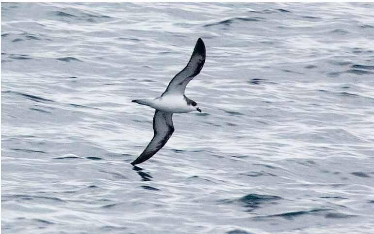
Figure 6. Hawaiian Petrel (HAPE-2008-1) over Grays Canyon, Grays Harbor Co., 27 September 2008.

WBRC in 1989 (Feltner et al. 1989) included the species on the basis of this report, but in 1994 the committee opted to refrain from accepting the record until more information could be gathered (Aanerud and Mattocks 2000). Reluctance to accept this record was due in part to concerns in distinguishing the species from other dark gadfly petrels. Advances in the knowledge of identification as well as the personal