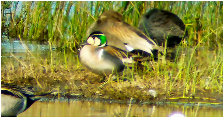
Figure 3. Male Baikal Teal (BATE-2008-1) at Columbia NWR, Grant Co., 30 May 2008.