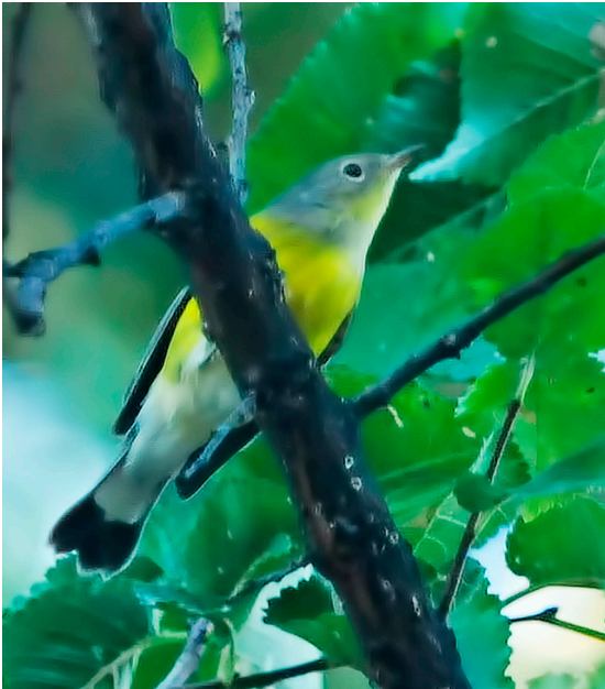
Figure 15. Magnolia Warbler (MAWA-2008-3) at Washtucna, Adams Co., on 10 September 2008.