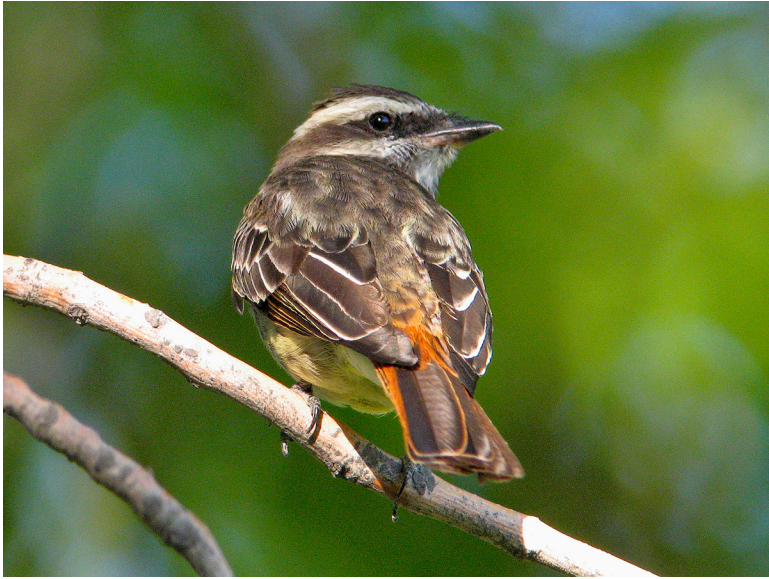
Figure 13. Washington's first Variegated Flycatcher (VAFL-2008-1) at Windust Park, Franklin Co., on 7 September 2008.