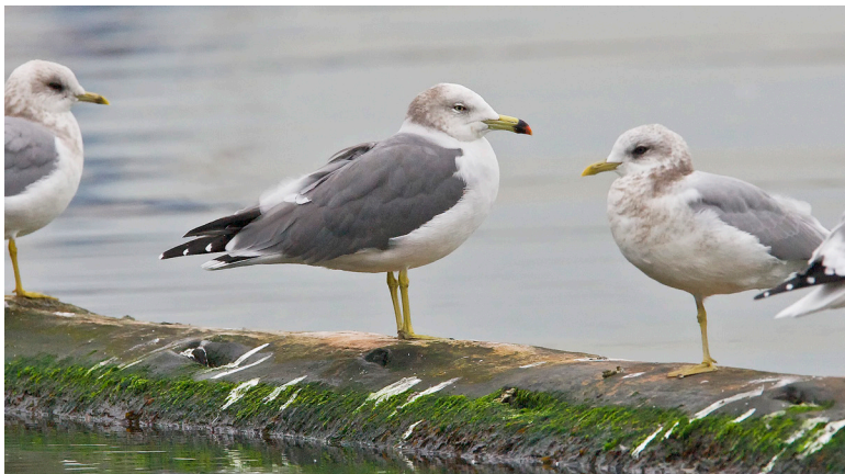
Figure 10. Adult Black-tailed Gull (BTGU-2009-2) in Tacoma, Pierce Co., 22 October 2009.

the identification was diagnostic from the photo alone. As a result, the Providence Petrel is accepted on the basis of a sight-only record. Murphy's Petrel ( P. ultima ), also known to occur in Washington waters, is similar but smaller with more slender wings, less bull-necked than the Providence Petrel, and has a smaller bill. Additionally the described pattern of the underwing is typical of the Providence Petrel and rarely seen on Murphy's. With respect to other dark gadfly petrels that may occur in the northeast Pacific, the pattern of the underside of the primaries eliminates both races of the Great-winged Petrel ( Pterodroma macroptera macroptera and P. m. gouldi ), which show a uniformly dull silvery patch. The uniform upper side of the wing eliminates the Kermadec Petrel ( P. neglecta ), whose outer primaries show obvious pale shafts.