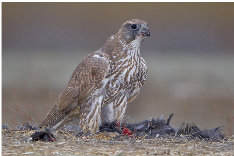
Figure 5. This second-year Gyrfalcon ( Falco rusticolus ), seen here finishing off an American Coot ( Fulica americana ) at the San Jacinto Wildlife Area, Riverside Co., 15 January–9 March 2012 (2012-007), was also recorded ~300 km away at Owens L., Inyo Co., 21 March 2012 (2012-056), and represents the southernmost record in North America.