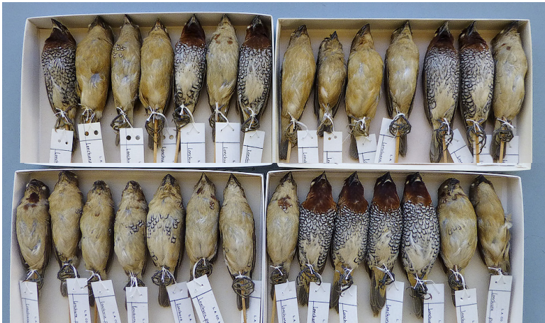
Figure 8. The Scaly-breasted Munia ( Lonchura punctulata , also known as the Nutmeg Mannikin) is now well established over much of the coastal slope of southern California, and the committee determined that the species met all criteria for addition to the California list as an introduced species. Shown here are 28 specimens from a series of 42 at the Natural History Museum of Los Angeles County and collected in Los Angeles and Orange counties between 1995 and 2014.