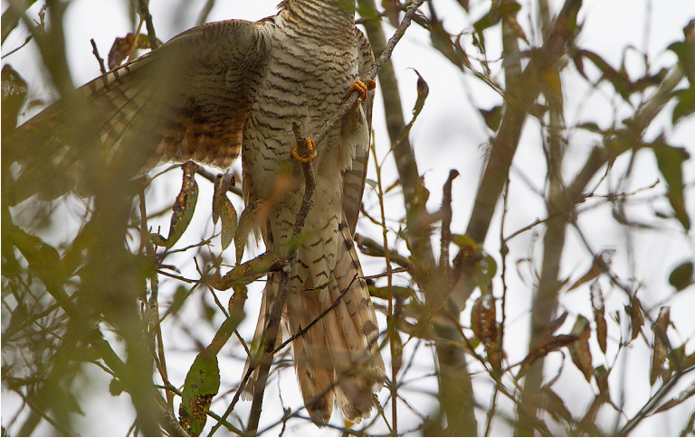
Figure 4. Albeit not a candidate for framing, this photo taken 29 September 2012 of a Common Cuckoo ( Cuculus canorus ) in Watsonville, Santa Cruz Co. (2012-147), shows thin, evenly spaced barring throughout the underparts, including across a uniformly pale underwing. The remarkably similar Oriental Cuckoo ( C. optatus ) has broad and dark ventral barring and a white stripe contrastingly bordered by dark across the median underwing, a feature completely lacking in this bird.