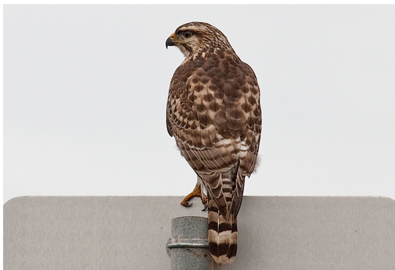
Figure 2. California's first accepted Gray Hawk ( Buteo plagiatus ) wintered near Carpinteria, Santa Barbara Co., 25 November 2012–15 March 2013 (2012-193). This photo, taken 25 December 2012, shows the considerable extension of the tail beyond the primary tips and extensively white cheeks, distinguishing it from the superficially similar juvenile Broad-winged Hawk ( B. platypterus ).