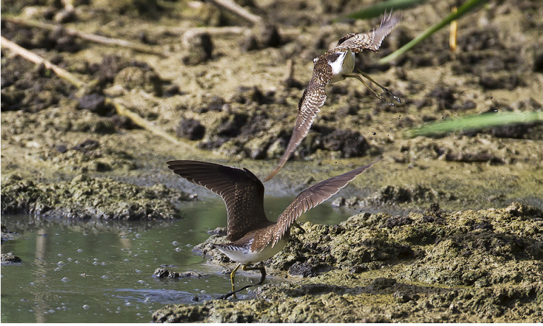
Figure 3. This Wood Sandpiper ( Tringa glareola ), California's second, spent 24–29 September 2012 at a sewage pond near the mouth of the Santa Margarita R., Camp Pendleton, San Diego Co. (2012-142). In this photo, taken 26 September, the completely white rump and coarse whitish and rufous upperpart spotting distinguish it from the Solitary Sandpiper ( T. solitaria ) just below it.