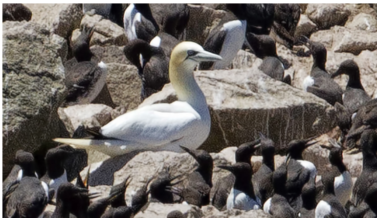
Figure 1. A first for California and the entire Pacific Ocean, this Northern Gannet ( Morus bassanus ) spent much of its time within a large colony of Common Murres ( Uria aalge ) on Southeast Farallon Island after its discovery on 25 April 2012. This photo was taken 24 June 2012 (2012-058).