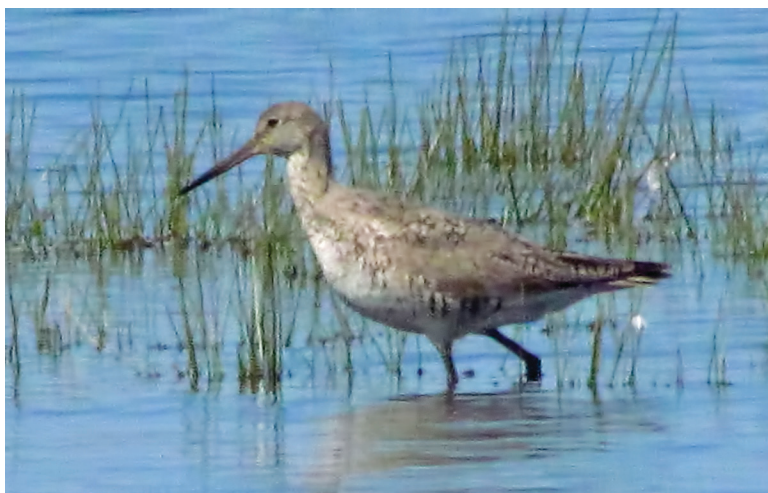
Figure 2. Willet ( Tringa semipalmata [ inornata ]), 22–30 June 2012, Kenai River mouth.