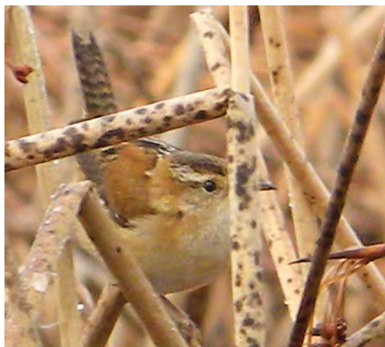
Figure 4. Marsh Wren ( Cistothorus palustris [ssp.]), 25 and 28 October 2009, Palmer Hay Flats.

Luscinia sibilans (Swinhoe, 1863) {Macao}. Rufous-tailed Robin. Breeds from south-central and southeastern Siberia to northeastern China and in the Russian Far East to Sakhalin, Ussuriland, and Kamchatka. Monotypic. FIRST ALASKA RECORDS (specimen and photos): UAM 24600, second-year ♀, 4 June 2008, Attu Island,