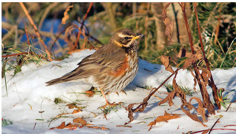
Figure 5. Redwing ( Turdus iliacus [ iliacus ]), 15–27 November 2011, Seward.