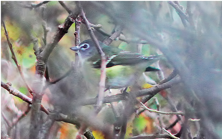
Figure 3. Blue-headed Vireo ( Vireo solitarius [ solitarius ]), 30 September and 2 October 2012, Middleton Island, Gulf of Alaska.