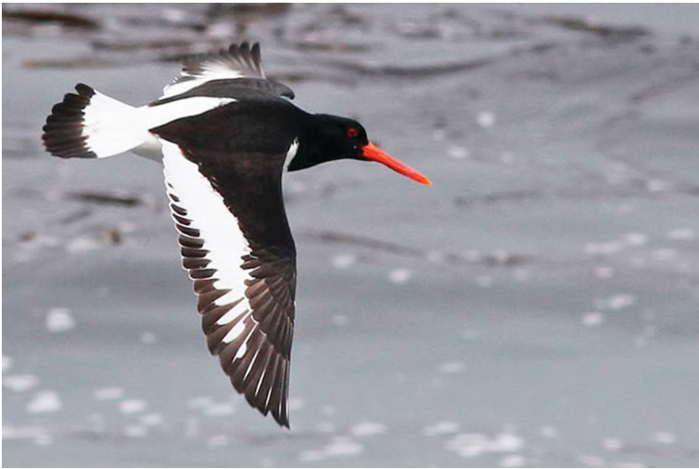
Figure 1. Eurasian Oystercatcher ( Haematopus ostralegus [ osculans ]), 26 May–13 June 2012, Buldir Island, Aleutians.