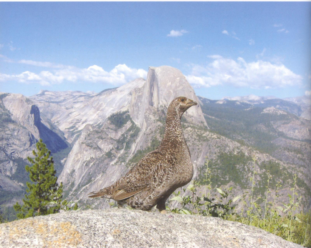
"Featured Photo" by © Floyd E. Hayes of Angwin, California: Sooty Grouse ( Dendragapus fuliginosus ), Glacier Point, Yosemite National Park, Mariposa County, California, 6 August 2006.