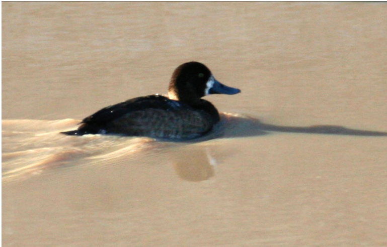
Figure 1. Female Greater Scaup ( Aythya marila ) at Lemon Tank, 4 November 2006.

Bufflehead ( Bucephala albeola ). Fidorra found a female at Lemon Tank on 10 November 2007, and Bradley saw it at the same location three days later. Subsequently, it was observed on a number of occasions, last on 23 November 2007. There are records of the Bufflehead from most of the California Channel Islands, with at least 15 for a reservoir on nearby Santa Catalina Island (P. Collins unpubl. data) on dates ranging from 23 November