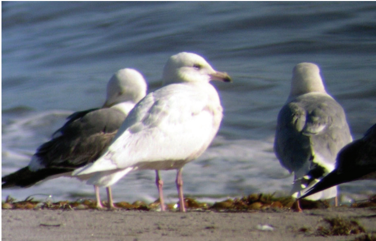
Figure 2. Glaucous Gull ( Larus hyperboreus ), likely in its first cycle, at West Cove Beach, 8 April 2006.

Glaucous Gull ( Larus hyperboreus ). Bradley and Fidorra found a Glaucous Gull, likely in its first year, at West Cove Beach on 8 April 2006 (Figure 2). It was subsequently seen by a number of observers, last on 19 April 2006. A second record involves a similar individual photographed by Fidorra at the same location on 13 May 2008. Sullivan and Kershner (2005) considered this species hypothetical on San Clemente Island on the basis of an undocumented sight record in February 2002. It is probably a casual visitor to San Clemente Island, as it occurs annually along the coast of nearby San Diego