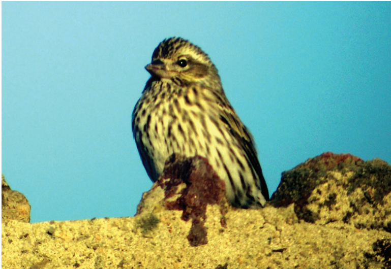
Figure 5. Female or first-year male Cassin's Finch ( Carpodacus cassinii ) at Lemon Tank, 5 November 2007.

Swamp Sparrow ( Melospiza georgiana ). Bradley photographed a single individual at the Natural Resources Office on 30 November 2007. It remained within a very small area of bushes and was eventually seen by a number of observers, last on 19 February 2008. This species is a rare but annual winter visitor to nearby coastal San Diego County (Unitt 2004), although it has been reported with decreasing frequency there in recent years (P. E. Lehman pers. comm.). It appears to be very rare on the California Channel Islands as a whole, with only four reports, from Santa Rosa, Santa Cruz, and Santa Catalina Islands (P. Collins unpubl. data). Although possibly underreported because of its skulking habits, the Swamp Sparrow prefers