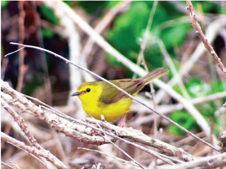
Figure 4. First-spring female Hooded Warbler ( Wilsonia citrina ) in Wilson Cove, 27 May 2007.

Black-chinned Sparrow ( Spizella atrogularis ). S. W. Stuart found two adults feeding a recent fledgling in Horse Canyon on 30 June 2006, representing the first record of this species' breeding not only for San Clemente Island but for any of the California Channel Islands. This is the same site where Stuart and Bradley heard two apparently territorial males singing