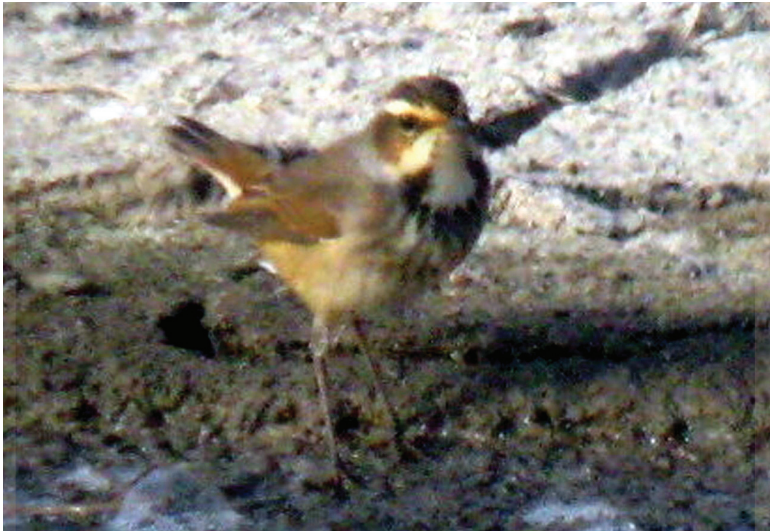
Figure 3. First-winter female Bluethroat ( Luscinia svecica ) at Lemon Tank, 14 September 2008.

On the basis of the phenology of the Bluethroat's fall migration in Alaska, the timing of this occurrence on San Clemente Island is appropriate for a natural vagrant. In many respects, an occurrence of a vagrant away from Alaska could be considered overdue, as other species with similar North