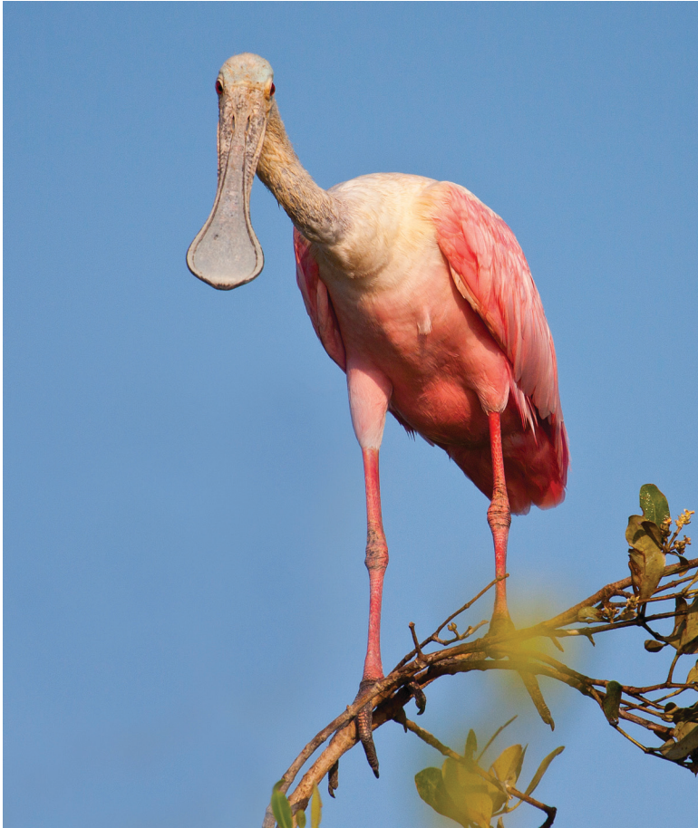
Figure 1. Roseate Spoonbill near colony at Bahía Kino, Sonora.

In 2008 and 2010, we made efforts to identify the breeding chronology. We first observed spoonbills in Estero Santa Cruz on 25 March in 2008 and on 18 April in