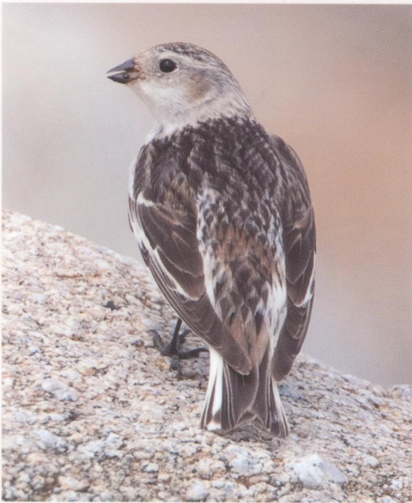
“Featured Photos” (top) by © Eric Kallen of San Diego, California: Snow Bunting ( Plectrophenax nivalis ), Ocean Beach, San Diego County, California, 2 May 2009 and (bottom) by © Brian Sullivan of Carmel Valley, California: same individual, Point Pinos, Monterey County, California, 26 May 2009.