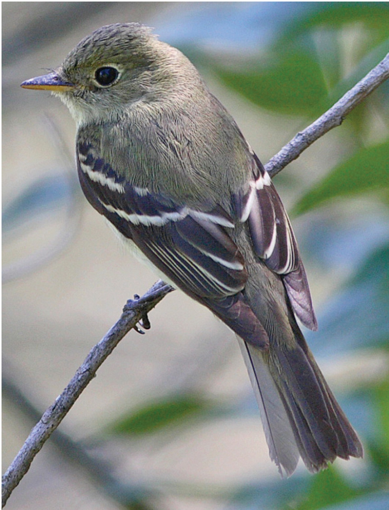
Figure 9. Yellow-bellied Flycatcher ( Empidonax flaviventris ) at Point Loma, San Diego County, on 6 Oct 2007.