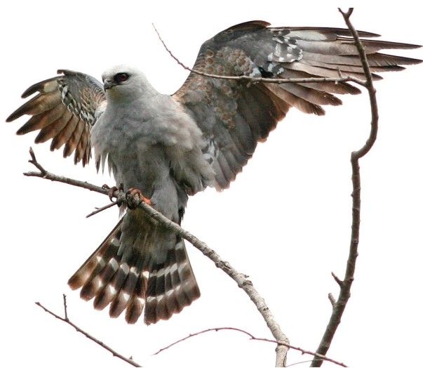
Figure 3. This stunning photo of a second-year Mississippi Kite ( Ictinia mississippiensis ) was taken 8 July 2007 in the Tijuana R. valley, San Diego County. The majority of California's records of this species are of one-year-old birds such as this one during late spring.