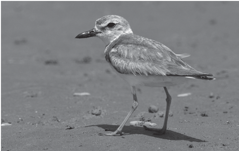
Figure 5. This Wilson's Plover ( Charadrius wilsonia ) at Coronado, San Diego County, 13–21 Jun 2007 was only the twelfth recorded in California but the seventh in well-covered San Diego County.

EURASIAN KESTREL Falco tinnunculus (1, 1). A juvenile female trapped, banded, and released at the Marin Headlands, MRN, 23 Oct 2007 [MA†; 2007-233; photo on back cover of Western Birds 39(3)] represented a first for California and the third and most southerly record on the Pacific coast of North America south of Alaska (Hull et al. 2008). This widespread Eurasian species has been recorded casually along the east coast of North America and from Alaska. Elsewhere in the West