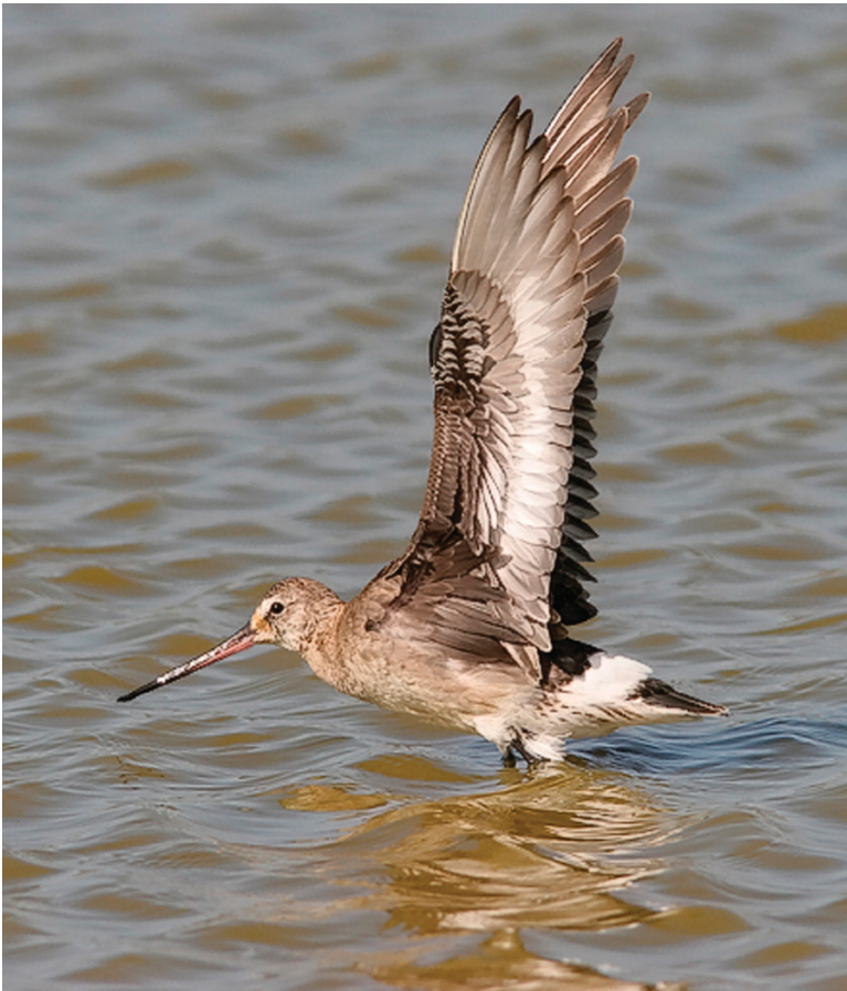
Figure 7. Hudsonian Godwit ( Limosa haemastica ) at the Salinas Wastewater Treatment Plant, Monterey County, on 13 September 2007. This photo captures the dark underwing coverts that distinguish this species from the similar Black-tailed Godwit ( L. limosa ) of Eurasia, which occurs very rarely to casually in western Alaska (most regularly in the western Aleutian Islands) and could reach California. The Black-tailed Godwit shows mostly white underwing linings.