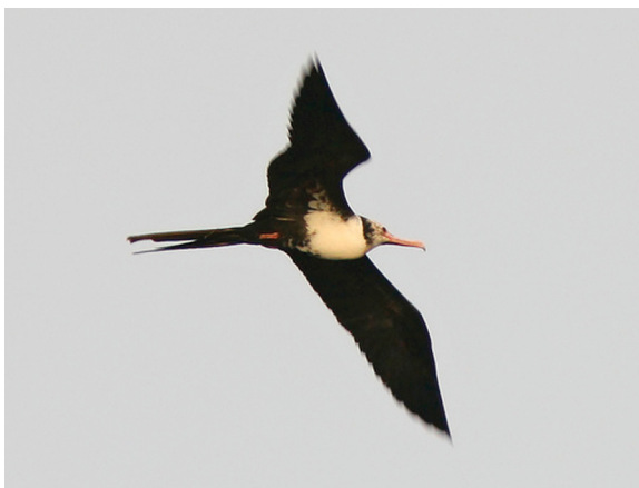
Figure 2. The first Lesser Frigatebird ( Fregata ariel ) for California and the fourth for North America was well documented at Arcata, Humboldt County, on 15 July 2007. Sullivan et al. (2007) summarized the features distinguishing the Lesser from other frigatebirds, many of which are visible in this photo (see text).