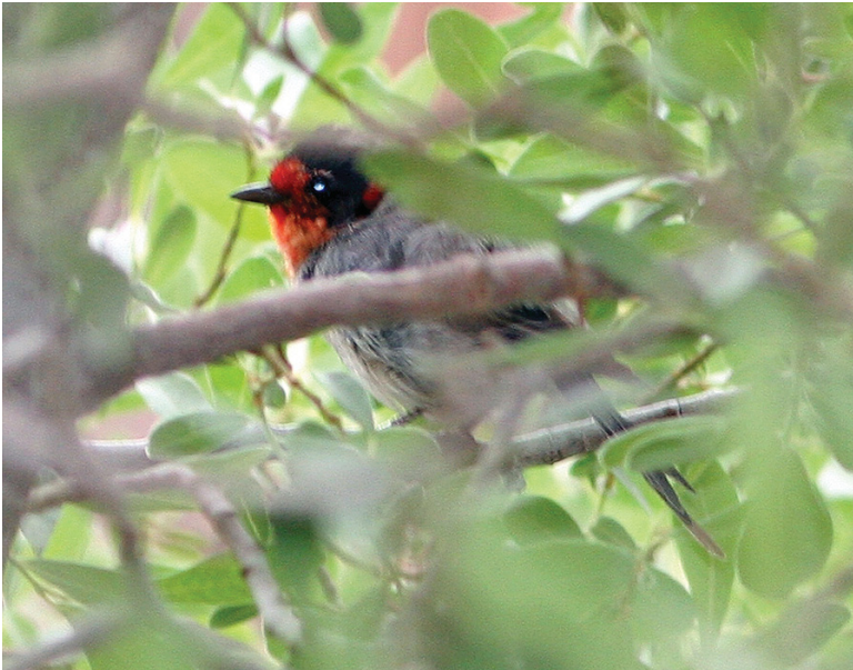
Figure 11. This Red-faced Warbler ( Cardellina rubrifrons ), probably a second-year male, was photographed on 14 July 2007 in Green Canyon in the San Bernardino Mountains in San Bernardino County, where it remained for more than three weeks.