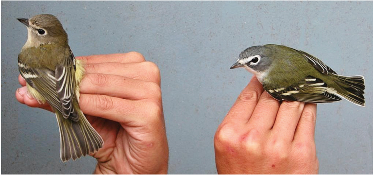
Figure 10. Comparison of a very bright Blue-headed Vireo ( Vireo solitarius ; right) and fairly typical Cassin's Vireo ( Vireo cassinii ; left) captured on Southeast Farallon I., San Francisco County, on 9 September 2007, a date very early for the Blue-headed Vireo in California.