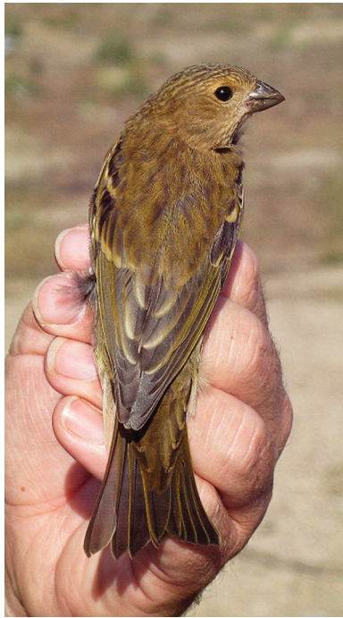
Figure 13. Although superficially similar to North America's resident Carpodacus finches, this Common Rosefinch ( C. erythrinus ) photographed in hand on Southeast Farallon I., San Francisco County, 23 September 2007, is readily identified the combination of short stubby bill with a strongly decurved maxilla, a blank-faced appearance created by a lack of any strong markings such as a supercilium, greenish or olive tones to much of the plumage, especially on the flight-feather edges, a lack of streaking on the undertail coverts (not visible here), and a notched tail.