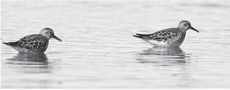
Figure 8. Representing the only accepted occurrence of the White-rumped Sandpiper ( Calidris fuscicollis ) in California involving more than one bird, these two were photographed together at the Naval Air Weapons Station, China Lake, Kern County, on 23 May 2007.