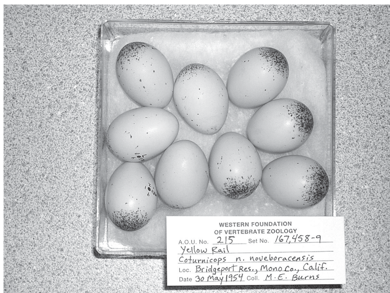
Figure 4. Set of Yellow Rail ( Coturnicops noveboracensis ) eggs collected at Bridgeport, Mono County, on 30 May 1954.