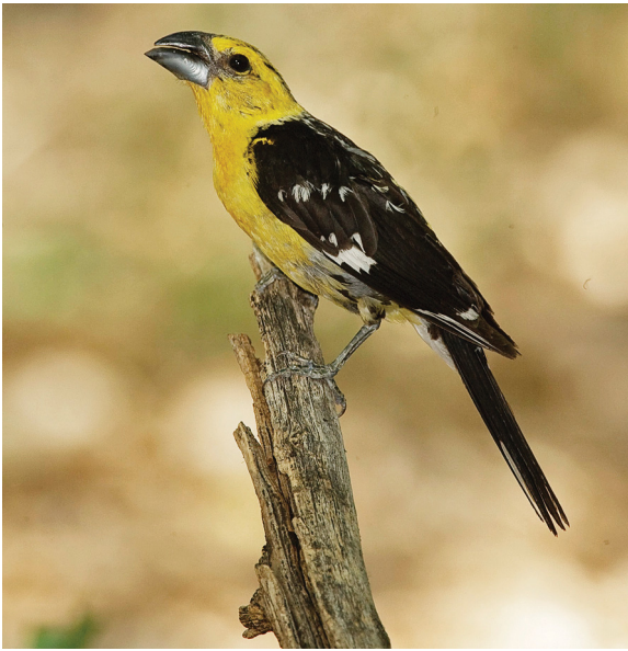
Figure 12. The anomalous plumage and bill led most members to question the natural occurrence of this Yellow Grosbeak ( Pheucticus chrysopheplus ) photographed 1 August 2006 at Keough Hot Springs, Inyo County. The black wings and large white patches at the base of the primaries are diagnostic for a male in its second year or older, yet the blackish or dusky on the crown appears to be retained juvenal feathers, a retention, to our knowledge, not matched by wild birds or specimens. The worn flank feathers, generally disheveled appearance, and lack of patterns of wear due to exposure to the elements on the tertials, inner greater coverts, outer primaries, and central rectrices suggest the bird could have been an escapee from captivity.