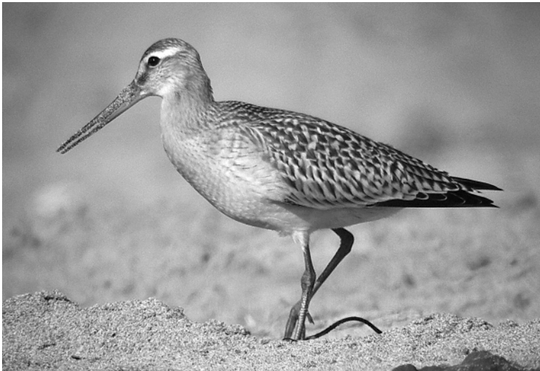
Figure 5. Superficially similar to the Marbled Godwit ( Limosa fedoa ), this Bar-tailed Godwit ( L. lapponica ) near Ft. Bragg, Mendocino County, 13 August 2006 differs structurally with shorter legs and a shorter, straighter bill. The face pattern is bolder; note the bold white postocular line. Also, the wing coverts lack any cinnamon tones and they are streaked, indicating a juvenile. There is no strong contrast between the coverts and the scapulars, whereas a juvenile Marbled has these coverts less marked, making them contrast more.