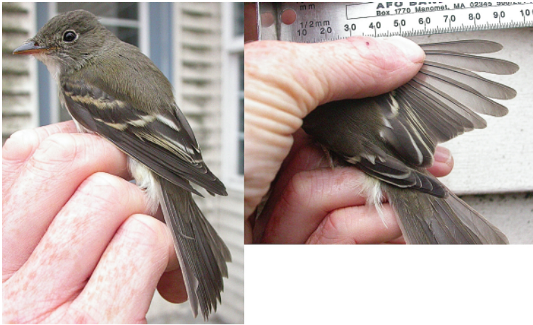
Figure 10. Acceptable documentation for an Alder Flycatcher ( Empidonax alnorum ) in California ideally involves extensive close examination and measurements, as shown here in these profile and spread-wing views of bird captured on Southeast Farallon Island, San Francisco County, 8 September 2006. Structural and plumage characters distinguishing this bird from the three western subspecies of the Willow Flycatcher ( E. traillii ) included the relatively stout bill, thin eye-ring, bold white tertial borders (diffuse in western Willow Flycatchers), auricular-throat contrast, and green tones to the dorsal plumage. Discrimination of the Alder from the much more problematic eastern Willow Flycatcher ( E. traillii traillii ) requires a battery of measurements and wingtip-shape characters (ideally supplemented by diagnostic call notes, which were not heard from this captured individual).