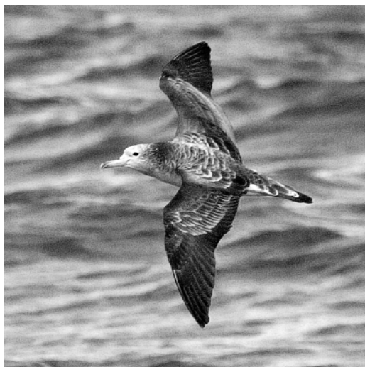
Figure 3. This photograph of a Streaked Shearwater ( Calonectris leucomelas ) taken in Monterey Bay on 15 October 2006 shows that the crown is pale, a dingy white, contrasting with a darker mantle. Some mantle feathers are edged pale, imparting the scaly look this species often shows. The dark-tipped bill is a pale straw color. Note the long dark tail, which has some pale whitish upper tail coverts; these upper tail coverts are quite variable, ranging from dark to an obvious white U-shaped band.