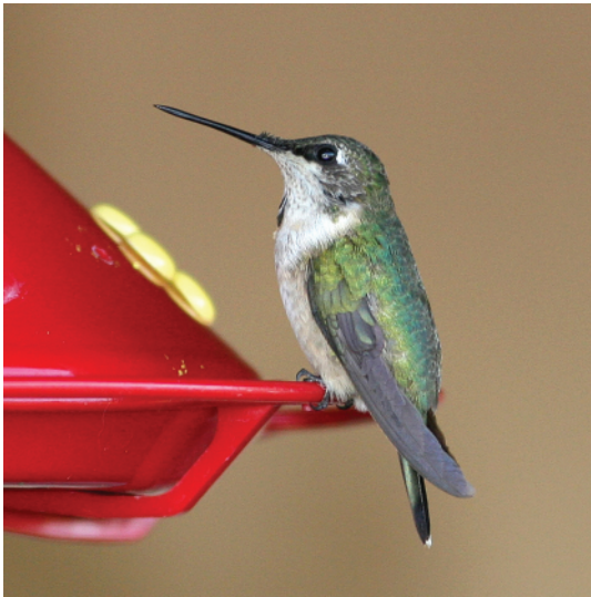
Figure 8. This Ruby-throated Hummingbird ( Archilochus colubris ) visited feeders in Arroyo Grande, San Luis Obispo County, 17–25 October 2006 (here 20 October). The narrow inner primaries indicate the genus Archilochus , eliminating more expected species like Anna’s Hummingbird ( Calypte anna ), which can share this upperpart coloration. The bright green upperparts, extending to the top of the crown, are a good feature for the Ruby-throated; the Black-chinned ( A. alexandri ) is invariably grayish on the forecrown (and only rarely bright green on the back). The straight bill is a further distinguishing feature but not diagnostic on its own. Barely visible at the tip of the wing is a narrow feather; this is the tip of primary 10, narrow and pointed in the Ruby-throated but blunt and rounded in the Black-chinned. Not visible in this photograph are two red gorget feathers that clinch the identification of this first-year male Ruby-throated Hummingbird.