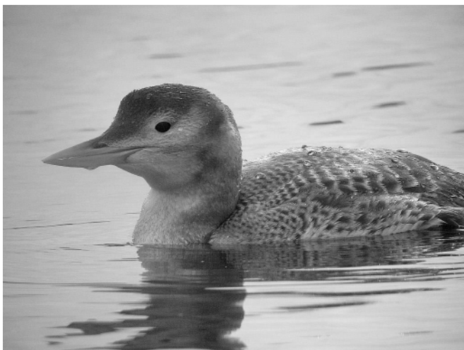
Figure 1. This crisp, close-up photograph provides great detail on the key identification marks of the Yellow-billed Loon ( Gavia adamsii ) at Pescadero, San Mateo County, 18–27 November 2006. The large pale bill is angled sharply on the lower mandible. Pale areas around the eye contrast with a darker crown and auricular; the back feathers are broadly edged paler, indicating a young bird.