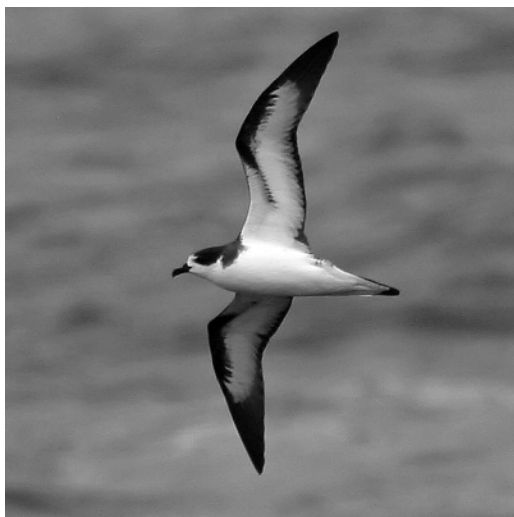
Figure 2. The combination of head, nape, and underwing pattern identify this bird photographed 13 August 2006 off Ft. Bragg, Mendocino County, as a Galapagos/Hawaiian Petrel ( Pterodroma phaeopygia/sandwichensis ). Force et al. (2007) highlighted the pattern of the dark hood as a feature distinguishing the two taxa formerly classified as one species, the Dark-rumped Petrel; they suggested that California records represent the Hawaiian Petrel.