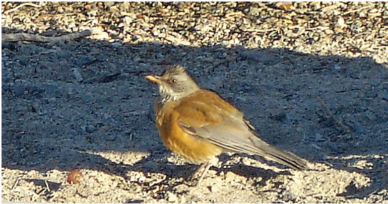
Figure 11. This Rufous-backed Robin ( Turdus rufopalliatu ) was fortuitously documented on camera during a brief visit to a remote desert feeding station east of the Salton Sea in Riverside County on 23 October 2006; the photograph and accompanying details had been submitted through the Cornell Laboratory of Ornithology's "Project Feederwatch."