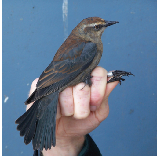
Figure 12. This first-year female Rusty Blackbird ( Euphagus carolinus ) was captured and banded on Southeast Farallon Island on 31 October 2006. Opportunities for finding and documenting Rusty Blackbirds in California have declined steeply in recent years in parallel to the species' overall significant decline.