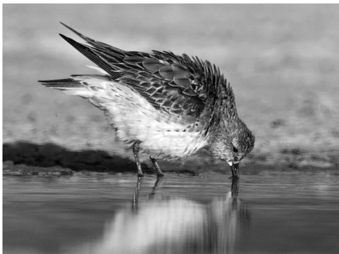
Figure 6. This stunning picture of a White-rumped Sandpiper ( Calidris fuscicollis ), taken at China Lake, Kern County, on 15 August 2006 shows not only the white rump but other subtle diagnostic features. Fall adults in molt are often dull grayish brown with few distinguishing features. This bird has molted in fresh gray scapulars of the basic plumage but retains some telltale feathers of the alternate plumage, including rufous-edged scapulars and streaking along the sides. The mandible has a pale orange base, another consistent feature of this species.

AMERICAN WOODCOCK Scolopax minor (2, 1). An astounding set of circumstances attended the discovery of a woodcock at Desert Center, RIV, 8-11 Nov 2006 (DGo; JG, CMcG†; LACM #114224; 2006-176). The bird was first found in a restricted area on 8 Nov, and a small group of birders was allowed access on a follow-up visit. Observers on 11 Nov saw the bird fly past them as it flushed and headed out to the desert; as they watched it for a half-mile, a Prairie Falcon ( Falco mexicanus ) pursued and then captured the woodcock in mid-air. After a cross-country trek, the birders found the falcon eating the woodcock while perched on a telephone pole. The falcon flushed, allowing the observers to retrieve some rectrices and other feathers, now archived at LACM, the first physical evidence of this species for California. The only other woodcock recorded in California was at the Iron Mtn. Pumping Plant, SBE, 3-9 Nov 1998 (Patten et al. 1999).