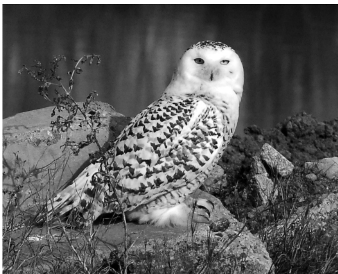
Figure 7. This Snowy Owl ( Bubo scandiacus ) was photographed on 19 January 2007 during its nearly month-long stay at Grizzly Bay, Solano County. It occurred approximately one year after another Snowy Owl nearby, so the question of whether this was a different individual arises. The heavily marked wings suggest a young bird, although some adult females are heavily marked too. Features not visible in this photo, such as an extensive white nape, thin tail bars, and uniform flight feathers support the conclusion that this was a first-winter bird. Older birds would likely show two generations of remiges.