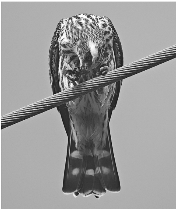
Figure 4. This juvenile Mississippi Kite ( Ictinia mississippiensis ) at Imperial Beach, San Diego County, 6–9 September 2006 was seen repeatedly capturing and devouring green fig beetles ( Cotinis mutabilis ), sometimes eating them on the wing. The tail is heavily banded with white, and the underparts are streaked brown.

COMMON BLACK-HAWK Buteogallus anthracinus (4, 0). An adult returning to near Santa Rosa, SON, 30 Apr–9 Oct 2006 (SM†; 2006-057) was presumed to be the same as the one there 14 May–29 Oct 2005 (Iliff et al 2007). Its schedule and prolonged stay raise many questions about its movements and vagrancy of the Common Black-Hawk in general. See also records not accepted, identification not established.