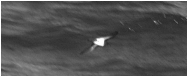
Figure 1. Fregetta storm-petrel, presumed White-bellied Storm-Petrel ( F. grallaria ), 456 km SE of Isla Clarion, Mexico (14° 50.52' N, 112° 35.46' W), 29 November 2006. Note the apparently entirely white belly and white underwing coverts contrasting with the blackish breast and head.

The bird was a small storm-petrel, appearing slightly larger in size than a Wilson's Storm-Petrel ( Oceanites oceanicus ), although no other birds were nearby at the time for comparison. It propelled itself with its feet, leaving small "rooster-tailed" splashes on the water (Figure 2), a characteristic of Fregetta and closely related genera of storm-petrels. The storm-petrel appeared to have a dark throat, a square or rounded tail, clear white underparts, white underwing coverts, and white uppertail coverts.