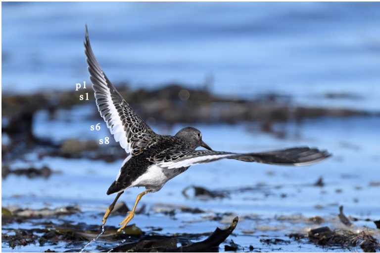
FIGURE 4. Rock Sandpiper in formative plumage (note bold white fringes on the upper wing coverts and several juvenile scapulars and rump feathers) on 18 September 2023, along the southwest coast of the Kenai Peninsula, Alaska. The white on the outer vanes of primaries p1–p3 appears to reach the shaft; the white on the outer vane of secondary s1 appears intermediate to extensive, between patterns B and C in figure 440 of Pyle (2008:600); and the dark marks on the middle secondaries are scored 4 on s6, 2 on s7, and 0 on s8, producing a \Sigma s6-8 of 6. Combined, these wing-stripe metrics support the bird's identification as mainland Calidris ptilocnemis tschuktschorum , the subspecies of the Rock Sandpiper common in this area during winter.