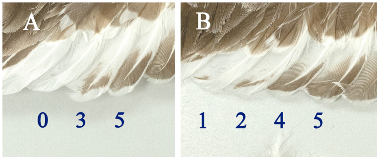
FIGURE 2. Examples of scores for dark marks on the portion of the secondaries exposed below the tip of the corresponding covert. Values range from 5 for a dark mark covering half or more of the exposed secondary (excluding its white tip and fringe), 4 for a mark covering between one half and one quarter of the exposed secondary, 3 for a mark covering roughly one quarter of the exposed secondary, 2 for a mark covering less than one quarter of the exposed secondary but more than in category 1, 1 for a single small mark, and 0 for a feather with no dark mark. (A) UAM 6861, subspecies Calidris ptilocnemis couesi , shows scores (left to right) on s8, s7, and s6, producing a \Sigma s6-8 of 8. (B) UAM 6826, also subspecies couesi , shows scores (left to right) on secondaries s9, s8, s7, and s6, producing a \Sigma s6-8 of 11.

To improve confidence in the identification of the wing samples reviewed, I considered only specimens or photographs obtained from within the breeding range of each subspecies between mid-May and early July (the breeding period). I inspected 175 specimens at UAM (97 flat wings or study skins with an extended wing and 78 traditional study skins with folded wings), plus photographs of 27 different birds (most at http://www.macaulaylibrary.org ). The total of 202 samples included 55 of ptilocnemis from St. Paul and St. Matthew islands, 47 of tshuktschorum from mainland Alaska, Nunivak Island, and St. Lawrence Island, and 66 of couesi from the Aleutian Islands (mostly Amchitka Island) and Cold Bay near the southwestern end of the Alaska Peninsula. The set also included 27 specimens from the southeast coast of the base of the Alaska Peninsula (Wide Bay) and the Chirikof Islands to the east of there. These have been considered couesi or possibly intergrades with tshuktschorum ; I treated them as an independent group (see Figure 1 for locations). To further evaluate differences between and possibly within the subspecies, I also divided the samples of tshuktschorum into two subsets, consisting of 33 from Cape Peirce west to the Seward Peninsula, spanning the