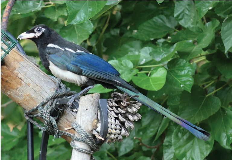
FIGURE 3. Presumed juvenile hybrid Yellow-billed Magpie \times Black-billed Magpie in Redding, California, 16 August 2023.