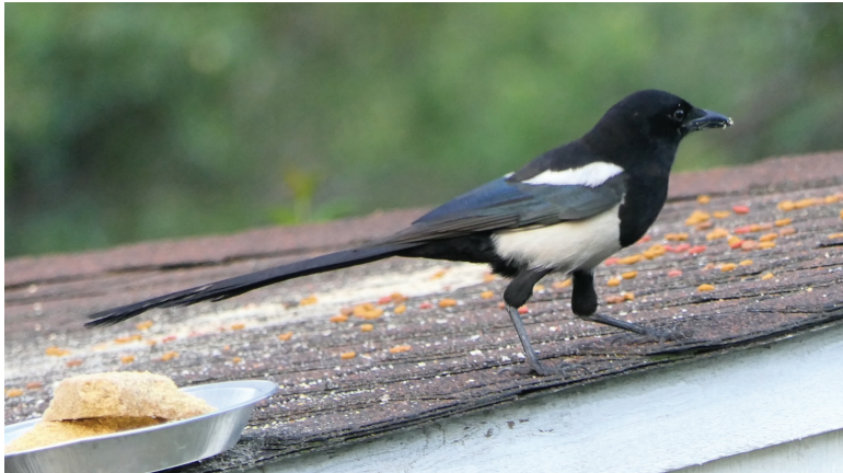
FIGURE 2. Adult Black-billed Magpie, the presumed parent of the hybrid young, at backyard feeder in Redding, California, 10 June 2023.

On 23 July 2023, Muegge observed one juvenile magpie with a light pink bill with light- to dark-gray blotching near the tip (Figure 3). A few days later he saw two