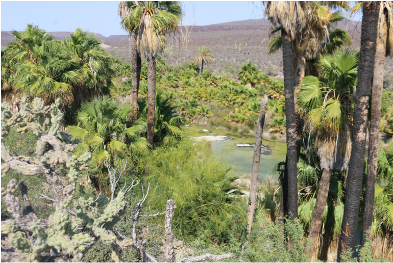
FIGURE 3. Las Casitas, 12 km southwest of San Ignacio, Baja California Sur, first verified as a site for Belding's Yellowthroat in 2024.