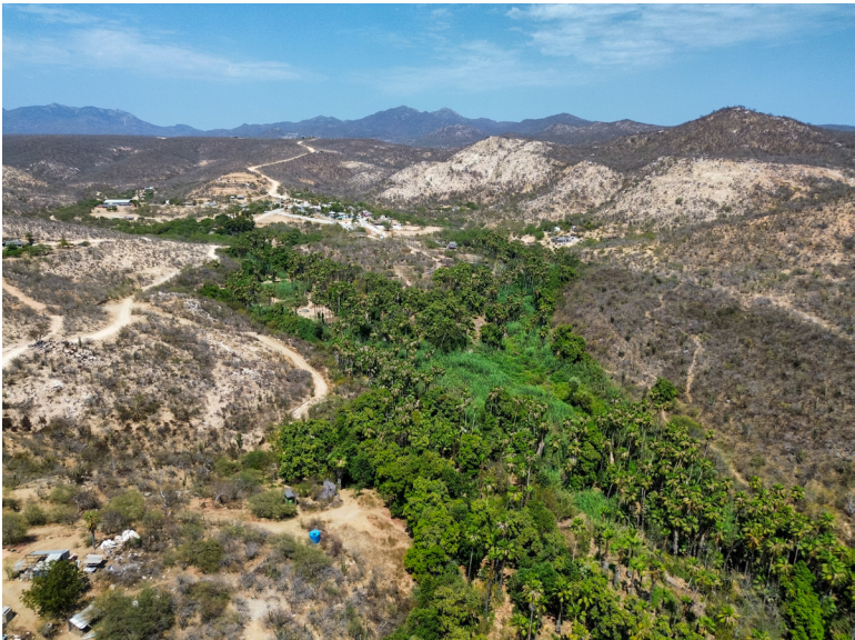
FIGURE 4. La Candelaria, 25 km northwest of Cabo San Lucas, Baja California Sur, first verified as a site for Belding's Yellowthroat in 2024.