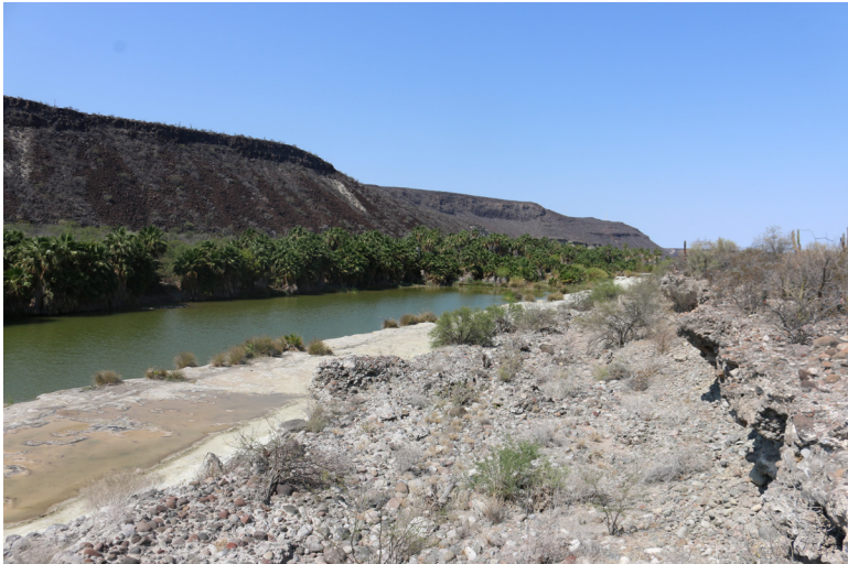
FIGURE 2. El Estribo, 7 km southwest of San Ignacio, Baja California Sur, first verified as a site for Belding's Yellowthroat in 2024.

In summary, most known localities for the Belding's Yellowthroat have remained stable, with 17 locations discussed by Erickson et al. (2008) still supporting the species. However, six locations of limited numerical signifi-