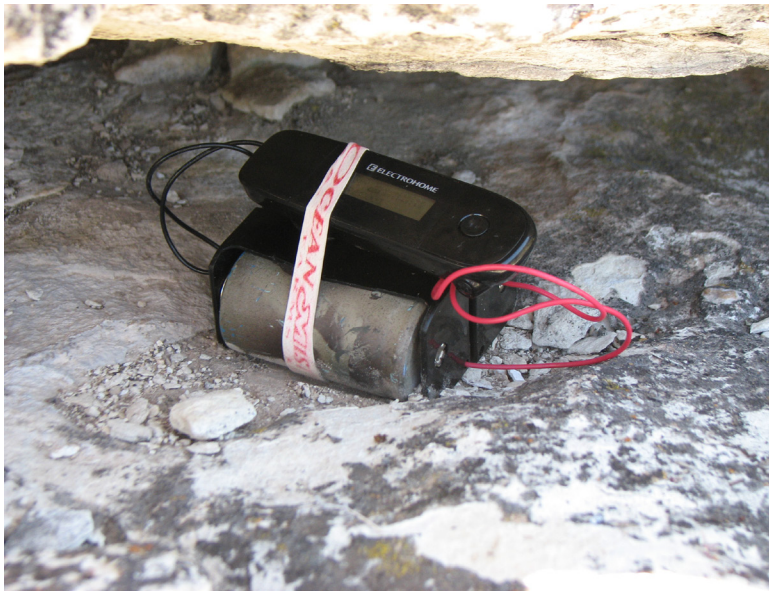
FIGURE 1. Sound-monitoring equipment deployed in Walnut Canyon, Arizona, to record the calls of Mexican Spotted Owls.

Sound monitoring started on 6 October 2014 and finished on 21 March 2015. During this time, daily mean ambient temperatures varied from -10.8 to 13.6 °C, with an average of 4.0 °C (Flagstaff Pulliam Airport, https://www.weather.gov/wrh/Climate?wfo=fgz ). One recorder each was deployed ~200–300 m from two known Spotted Owl nests, in rock niches protected from precipitation and animal investigation by a natural overhanging cliff, as depicted in Figure 1. The recorders monitored sound continuously for