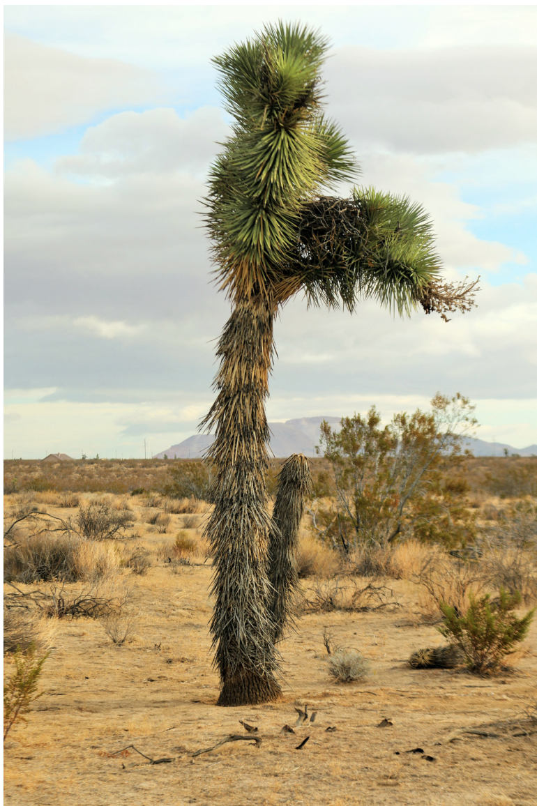
FIGURE 3. Swainson's Hawk nest in Joshua tree in native desert in the Antelope Valley, Kern County, California, November 2021.