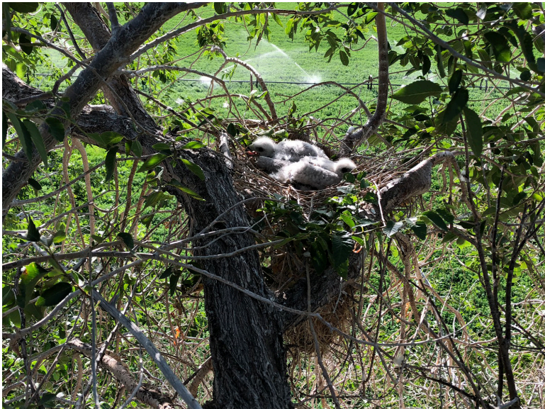
FIGURE 2. Swainson's Hawk nest in elm tree and adjacent alfalfa fields in the Antelope Valley, Los Angeles County, California, July 2020.

Between 1979 and 2022 we recorded the remains of 170 prey observed in 50 Swainson's Hawk nests, identified to the lowest taxonomic level allowable (Table 2). Observed prey consisted entirely of vertebrates and almost entirely of rodents (82.9%, n = 141 ). Birds represented 7.1% ( n = 12 ) of the total prey items, followed by reptiles (6.5%, n = 11 ) and amphibians (3.5%, n = 6 ). Of the 170 items observed, Botta's pocket gopher ( Thomomys bottae ) was the dominant prey, found in 23 nests. The California vole ( Microtus californicus ) and California ground squirrel ( Otospermophilus beecheyi ) were the next most common prey, observed in 10 and five nests, respectively.