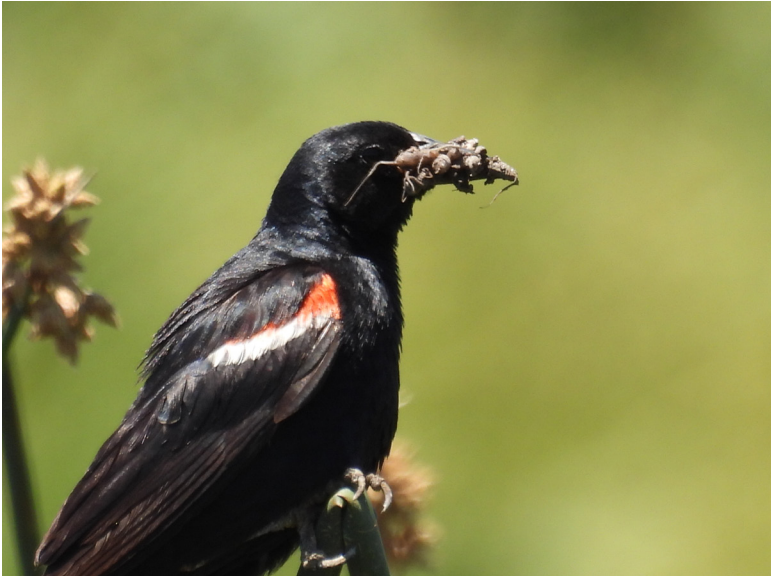
FIGURE 5. Male Tricolored Blackbird with drone fly larvae from nearby dairy.