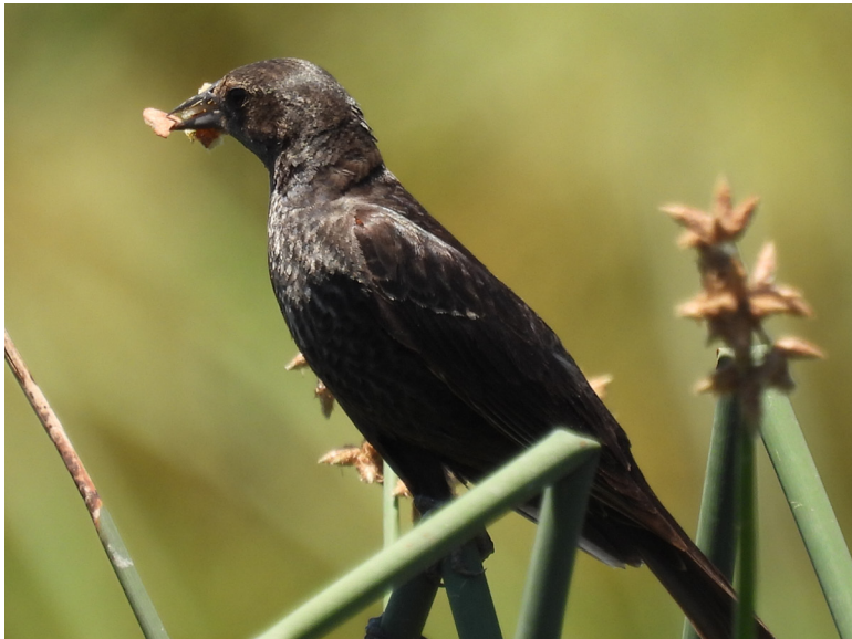
FIGURE 6. Female Tricolored Blackbird with almond hulls from nearby dairy.

The remaining 20% of feeding visits originated in rank weedy vegetation next to the colony and the waterfowl ponds as well as up to 1 km out on the bed of Mystic Lake. Nearby Perennial Pepperweed provided food for the tricolors in the form of swarms of small and medium-sized flies, including house flies, that were nectaring at the flowers. The tricolors picked flies off of the flowers and also foraged underneath their canopy for other unidentified insects.