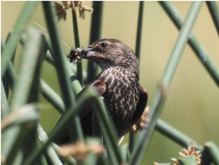
FIGURE 3. Female Tricolored Blackbird with flies from nearby dairy.

In early June, we began seeing tricolors returning from the dairies with bills packed with larvae of the drone fly ( Eristalis tenax ) with their characteristic breathing siphons visible (Figures 4, 5). On 7 June, we watched from a distance of 100–140 m a flock of about 200 tricolors walking slowly around the partially filled dairy-effluent ponds, concentrated at the edge of open water, probing frequently into the muck with their bills inserted deeply into the substrate. This probing was notably different from the lunges and short flights observed at the cattle yards, and since this was the only wetland or muddy habitat in this foraging area, it clearly was the source of the drone fly larvae brought back to the nestlings. A few of the birds at the effluent ponds also hunted among the horseweed and on the dry mud at the pond edges. During mid-June, the birds coming from the dairy were spread out, and it was difficult to distinguish how many originated at the cattle yards and how