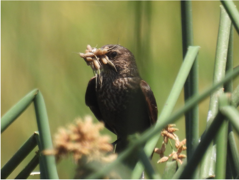
FIGURE 4. Female Tricolored Blackbird with drone fly larvae from nearby dairy.