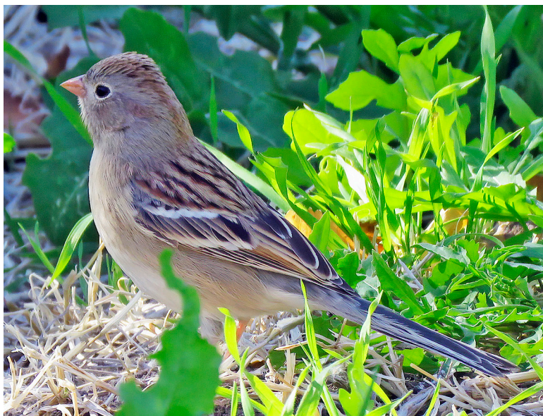
FIGURE 10. Field Sparrow ( Spizella pusilla ), Corn Creek, Desert National Wildlife Refuge, Clark Co., Nevada, 9 November 2018, the first to be recorded in Nevada.