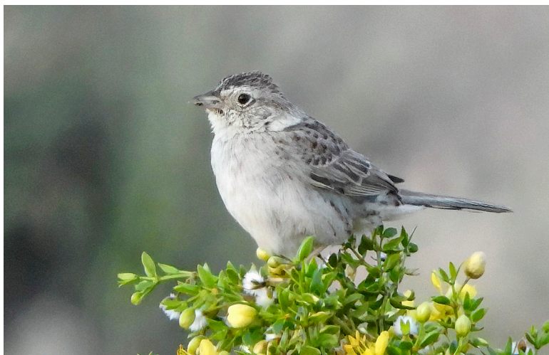
FIGURE 9. Cassin's Sparrow ( Peucaea cassinii ), Beatty, Nye Co., Nevada, 13–30 May 2019. In spring 2019 Cassin's Sparrow irrupted west of its normal range, yielding the fourth and fifth records for Nevada.