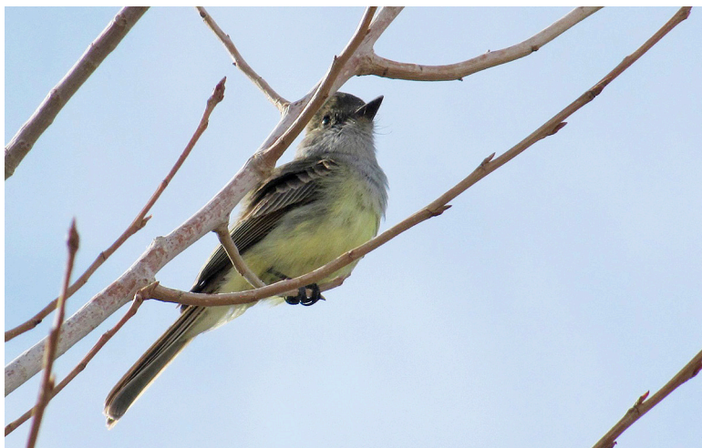
FIGURE 5. Dusky-capped Flycatcher ( Myiarchus tuberculifer ), Big Smoky Valley, Nye Co., Nevada, 31 May–1 June 2020, representing a third record for Nevada.