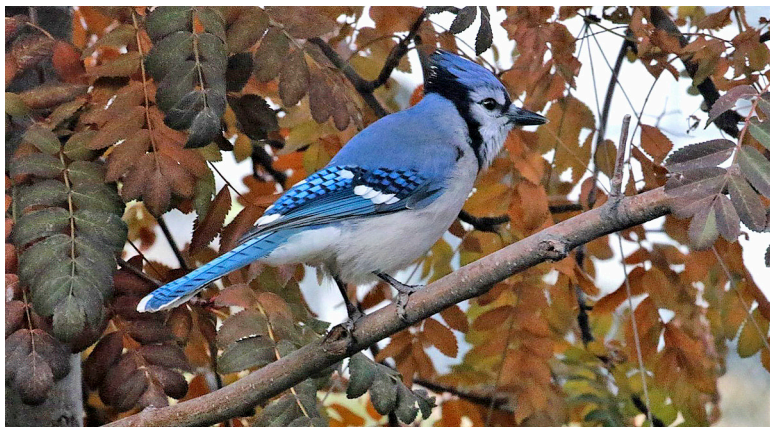
FIGURE 6. Blue Jay ( Cyanocitta cristata ), Elko, Elko Co., Nevada, 29 October 2019–28 March 2020, representing a sixth record for Nevada.

*YELLOW-BILLED LOON Gavia adamsii (11**, 1). 2019-007, Incline Village (Washoe), 6 Jan 1973. D. DeSante. Earliest NBRC-endorsed record. This observation