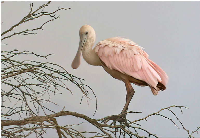
FIGURE 3. Roseate Spoonbill ( Platalea ajaja ), Ash Meadows National Wildlife Refuge, Nye Co., Nevada, 3–11 September 2019, representing a fifth record for Nevada.