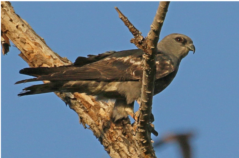
FIGURE 4. Mississippi Kite ( Ictinia mississippiensis ), Clark County Wetlands Park Nature Preserve, Nevada, 1 July–8 August 2020, the first known to have remained in Nevada for an extended period.