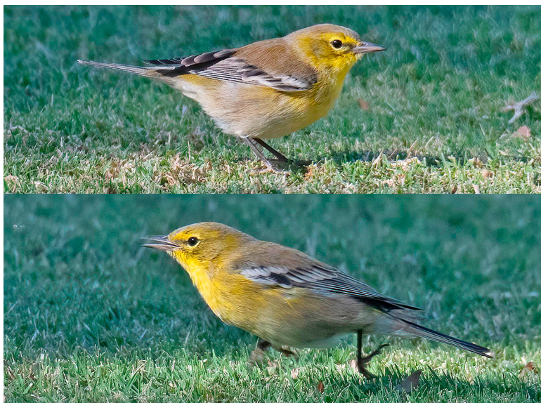
FIGURE 14. Pine Warbler ( Setophaga pinus ), Arroyo Grande Sports Complex, Clark Co., Nevada, 22–23 October 2020, representing a first record for Nevada.