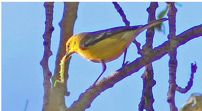
FIGURE 12. Blue-winged Warbler ( Vermivora cyanoptera ), Carson River Diversion Dam, Churchill Co., Nevada, 28 May 2020, representing a sixth record for Nevada.