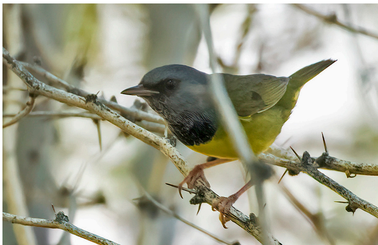
FIGURE 13. Mourning Warbler ( Geothlypis philadelphia ), Cactus Springs, Clark Co., Nevada, 1–2 June 2019, representing a fourth record for Nevada (and preceding the fifth by a single day).