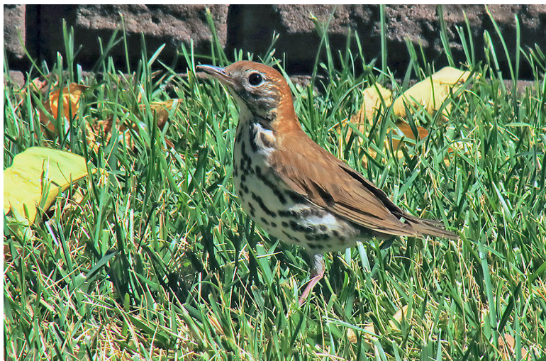
FIGURE 7. Wood Thrush ( Hylocichla mustelina ), Henderson, Clark Co., Nevada, 13 May 2020, representing an eighth record for Nevada.