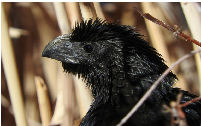
FIGURE 2. Groove-billed Ani ( Crotophaga sulcirostris ), Las Vegas Wash, Clark County Wetlands Park, Nevada, 5 December 2018–30 January 2019, representing a fifth record for Nevada.

Multiple observations of a species are ordered chronologically. Any discussion of the species in general, not specific to an observation, concludes the account if warranted.