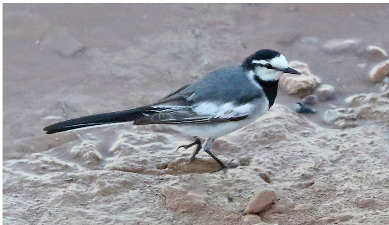
FIGURE 8. White Wagtail ( Motacilla alba ), Bowman Reservoir, Clark Co., Nevada, 12 April 2019, representing a second record for Nevada.

CASSIN'S SPARROW Peucaea cassinii (5, 2). 2019-012, Wee Thump Joshua Tree Wilderness (Clark), 27 April 2019. J. Streit (P).