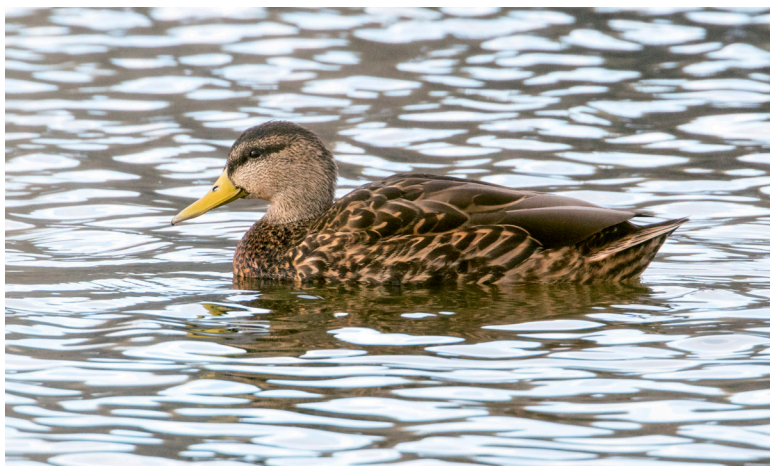
FIGURE 1. Mexican Duck ( Anas diazi ), Henderson Bird Viewing Preserve, Clark Co., Nevada, 14 January 2017, one of the six the Nevada Bird Records Committee endorses in this report.