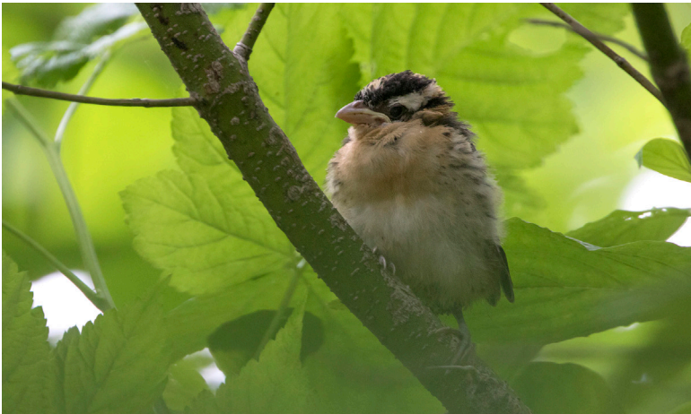
FIGURE 2. Fledgling Black-headed Grosbeak ( Pheucticus melanocephalus ) along the Stikine River in southeast Alaska on 28 June 2020. This photograph represents the first documentation of breeding of the Black-headed Grosbeak in Alaska.