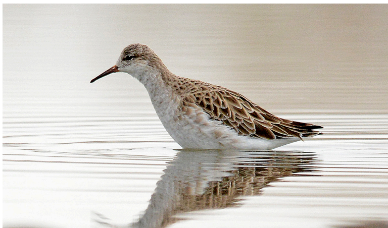
FIGURE 1. Ruff ( Calidris pugnax ), 29 Jan 2018, S-Line Reservoir, Fallon, Churchill County, Nevada.