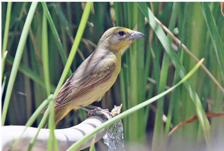
FIGURE 6. Hepatic Tanager ( Piranga flava ), 4 Jun 2018, Cactus Springs, Clark County, Nevada.