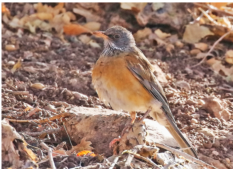
FIGURE 5. Rufous-backed Robin ( Turdus rufopalliatu ), 3 Dec 2017, Spring Mountain Ranch State Park, Clark County, Nevada.