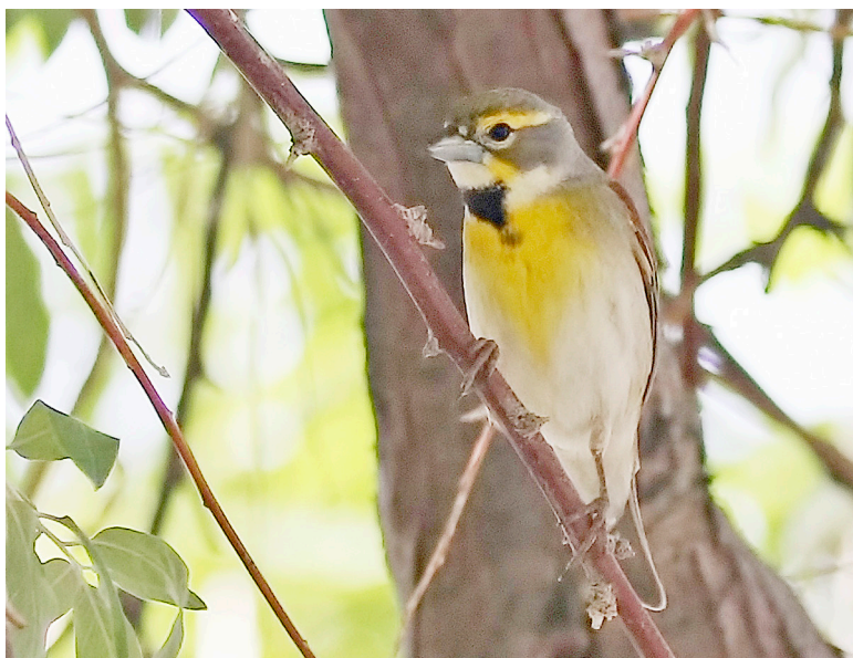
FIGURE 8. Dickcissel ( Spiza americana ), 5 Jun 2018, Miller's Rest Stop, Esmeralda County, Nevada.