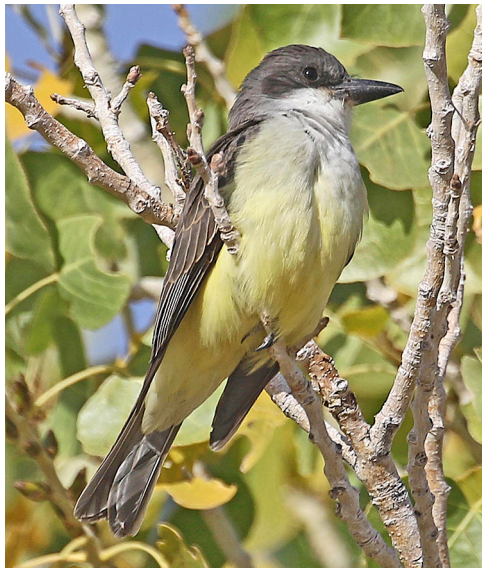
FIGURE 4. Thick-billed Kingbird ( Tyrannus crassirostris ), 13 Nov 2017, Floyd Lamb Park at Tule Springs, Las Vegas, Clark County, Nevada.