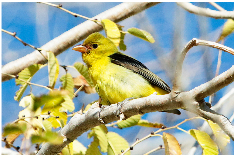
FIGURE 7. Scarlet Tanager ( Piranga olivacea ), 4 Nov 2017, Corn Creek, Desert National Wildlife Refuge, Clark County, Nevada.