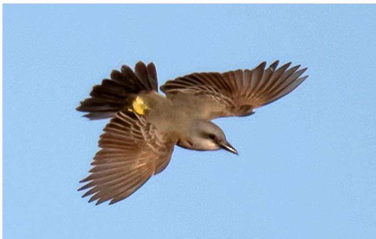
FIGURE 3. Tropical Kingbird ( Tyrannus melancholicus ), 8 Jun 2018, Corn Creek, Desert National Wildlife Refuge, Clark County, Nevada.