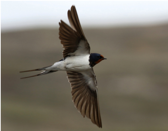
FIGURE 3. This male Barn Swallow at Qikiqtaruk on 19 and 20 June 2019 was a typical example of H. r. rustica , having a bright white underside, thick dark breast band (with just a few scattered rufous feathers), and relatively long tail streamers (though not as long as the bird in Figure 1). See also this issue's inside front cover.