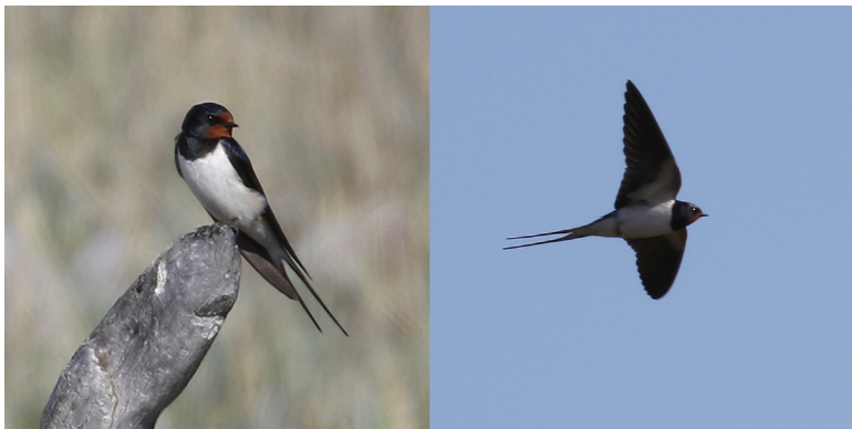
FIGURE 2. Male Barn Swallow ( H. r. rustica ) at Qikiqtaruk on 24 June 2015 with bright white undersides, a broad dark and unbroken breast band, relatively small rufous throat patch, and very long tail streamers.

ined photos taken 3 July 2010 of a pale-bellied bird with a complete thick blue-black neck band, a relatively long tail, and a relatively restricted rufous throat patch consistent with nominate rustica (Figure 1). However, the photos left some uncertainty in the identification and so this record is noted with question mark (Table 1). On 24 June 2015, Eckert saw a Barn Swallow that flashed a bright white belly, undertail, and wing lining. It had a thick and