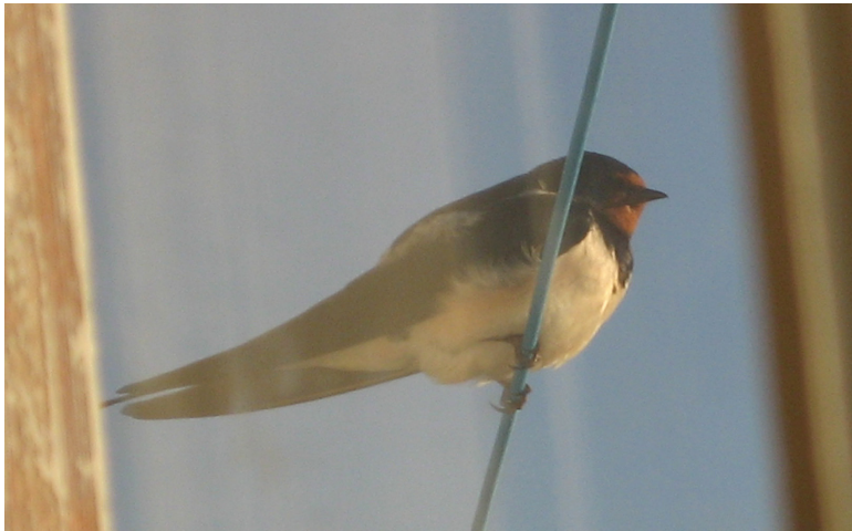
FIGURE 1. A Barn Swallow at Qikiqtaruk 3 July 2010 with a solid dark breast band and long tail (shown in other photos), suggesting H. r. rustica though with some uncertainty.