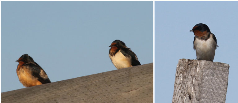
FIGURE 4. A pair of Barn Swallows at Qikiqtaruk on 12 June 2016 included one H. r. erythrogaster (left) and one individual of uncertain identity (right); the latter showed paler undersides and a slightly broken breast band.

solid blue-black neck band, a relatively limited deep rufous throat patch, and a very long tail (Figure 2). All features of this bird were consistent with nominate rustica . The next day, 25 June 2015, Eckert observed another Barn Swallow that flew through the settlement for less than 30 seconds, though enough time for him to get a good look at the rufous undersides and a broken