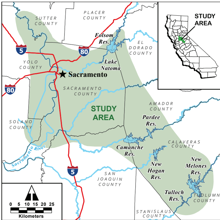
FIGURE 1. Osprey study area in central interior California showing major water bodies surveyed.

To avoid bias (Steenhof 1987), we calculated reproductive success only on the basis of nests that we or others (e.g., ebird.org) observed adults attending before the end of April (“adequately monitored”). We considered nests successful in fledging young when we estimated that young were >80% of adult size (roughly 6–7 weeks from hatching).