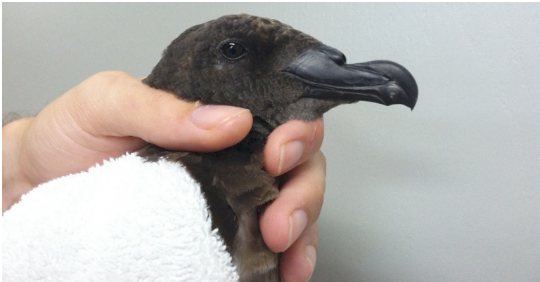
Figure 1. Close-up view of the head and bill of the Tahiti Petrel that came aboard a ship off Kaula'i, 26 January 2012.