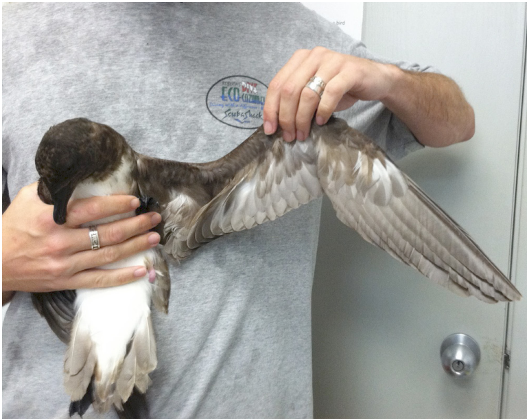
Figure 3. Ventral view of the left wing of the Tahiti Petrel.