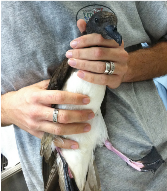
Figure 4. Ventral view of the Tahiti Petrel, including one foot.