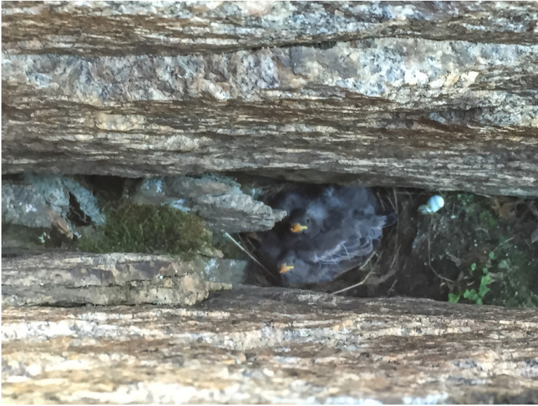
Figure 2. Black Rosy-Finch chicks on nest in the Beartooth Mountains, Wyoming, 16 July 2015.