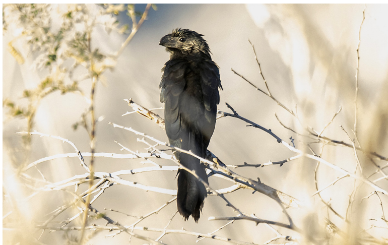
Figure 1. The second Nevada record of the Groove-billed Ani came 11 years after the first, nearly to the day. The first was observed on 28 October 2004 at the Henderson Bird Viewing Preserve, and this bird was found on 27 October 2015 at Big Bend of the Colorado State Recreation Area (both in Clark County).