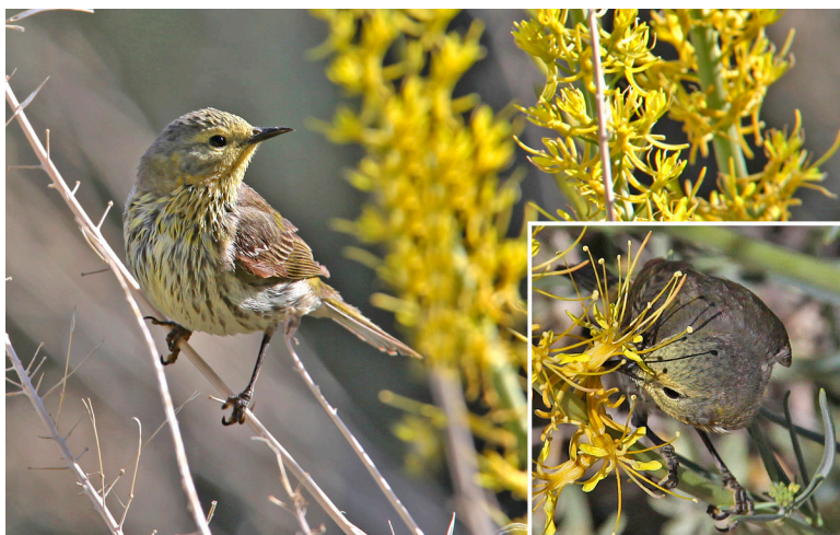
Figure 8. This northbound Cape May Warbler may have been fueling on the nectar of Prince's Plume ( Stanleya pinnata ) along with the insects attracted to this plant during a two-day visit to the Tonopah Cemetery (Nye County) in May 2016.