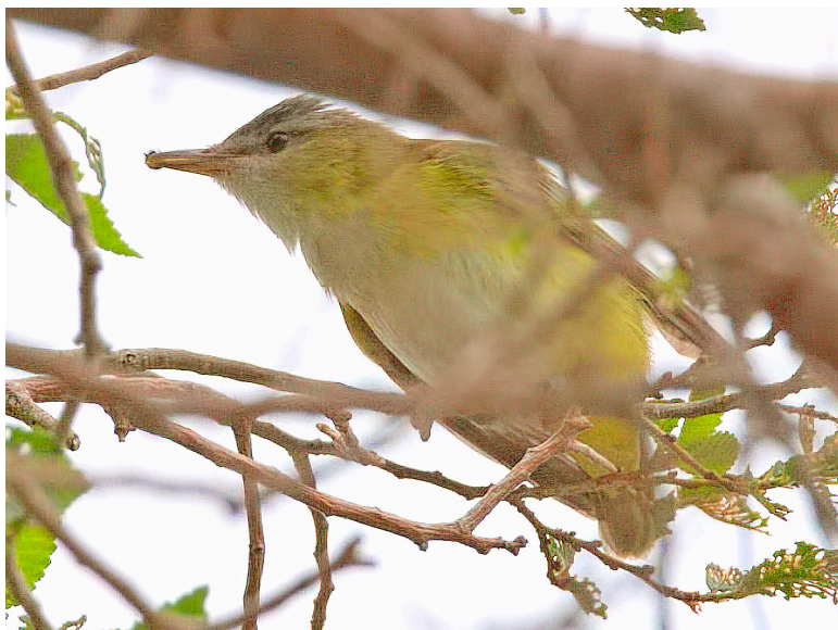
Figure 6. Breeding largely south of the Mexican border, the Yellow-green Vireo is highly migratory, heading to South America for the winter. This individual strayed north in late September 2016 to Mountain Springs (Clark County).