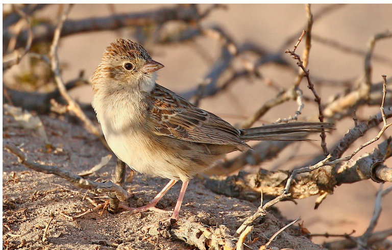
Figure 7. Nevada's third Cassin's Sparrow, found in Amargosa Valley (Nye County) in late September 2015, was the first of the species observed in fall.