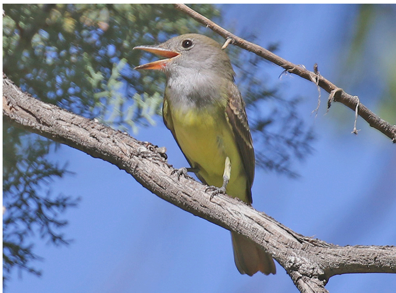
Figure 5. The Great Crested Flycatcher has been recorded three times in Nevada, and all of the observations have come from Esmeralda County between late September and the first week of October. This individual was found on 20 September 2015.