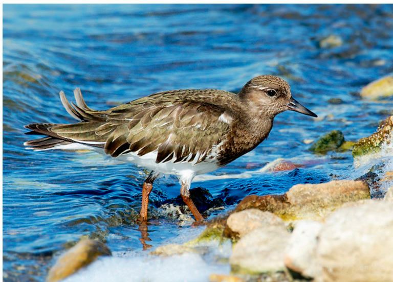
Figure 2. A six-day visit provided birders plenty of time to document Nevada's second Black Turnstone. This bird was observed 22–27 August 2015 in the southern part of the state (Clark County), whereas the first Nevada record was of an April migrant found in the middle region (Churchill County).