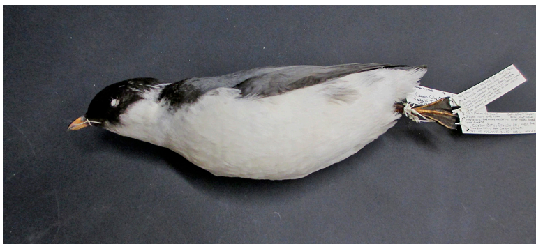
Figure 4. Ancient Murrelet records have been endorsed four times for Nevada. This specimen, collected in 1965 in Carson City after a late November storm, represents the first.