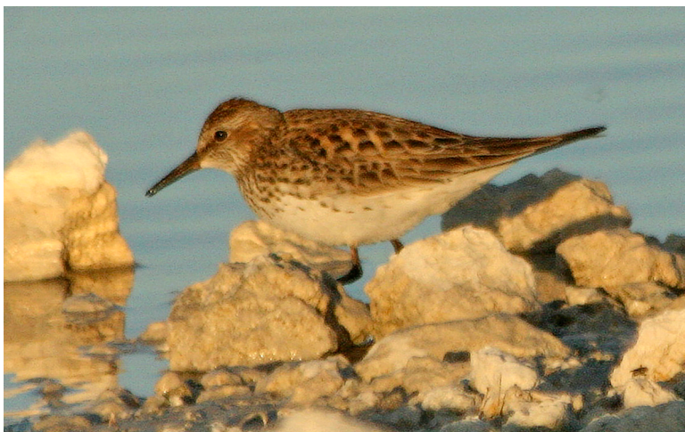
Figure 3. The White-rumped Sandpiper was the only species new to Nevada found in 2016. It was observed along the shore of Crystal Reservoir, Ash Meadows National Wildlife Refuge (Nye County), on 1 June 2016.