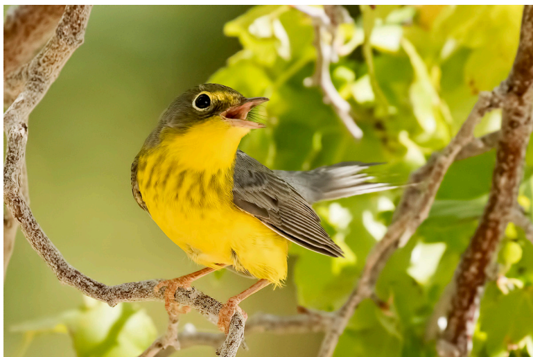
Figure 9. Four of the five Canada Warblers recorded in Nevada have occurred in the two-week interval from 8 to 22 September. This adult female was observed from 16 to 19 September 2016 at Floyd Lamb Park at Tule Springs in Las Vegas (Clark County).